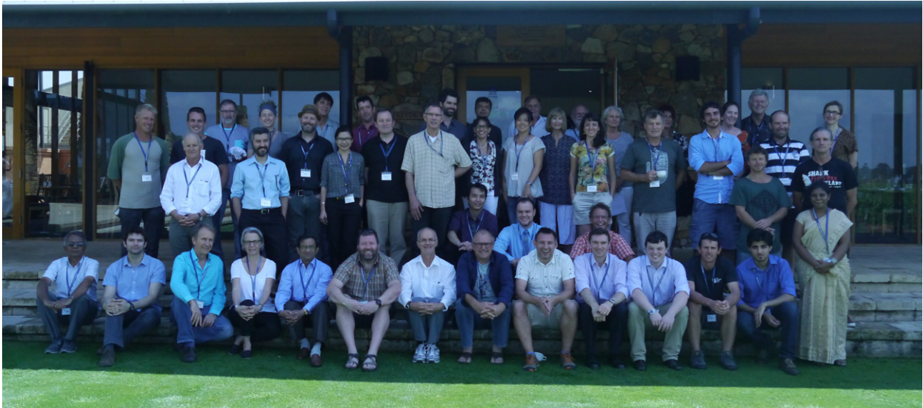
Figure 1. ICREC2015 delegates

temperatures would not allow for the use of non-insulated walls (Krayenhoff, 2015). The design of these walls often involves a highly conservative approach, that is to neglect the presence of the insulation sheet and the inner rammed earth wythe (i.e. the internal face of the insulated wall), and to rely exclusively on the structural capacity of the monolithic external wythe. Sometimes builders insert steel ties between the rammed earth wythes through the insulation layer to enforce the composite action (Krayenhoff, 2015). The structural contribution of these ties, their thermal impact and the overall strength capacity of the composite wall (rammed earth layer–insulation sheet–rammed earth layer) to resist out-of-plane loads is not well understood and needs further research.