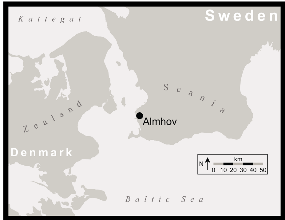
Fig 1. The location of Almhov in Scania.