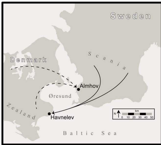
Fig. 1. The locations of the sites. The dashed arrows highlight the closest potential region of origin for Sample #2 and the solid arrows highlight the same for Sample #23 (see Results and discussion). Figure modified from Gron et al. (2015).

southern Scandinavia. These materials present, therefore, the only opportunities for selecting more than one or two different individual cattle for analysis from particular sites. Furthermore, both sites are located in regions where aurochs ( Bos primigenius ) were extinct during the early Neolithic (Aaris-Sørensen, 1999; Ekström, 1993), so all teeth are of domestic origin. Previous strontium isotope data are available from the teeth from Almhov (Gron et al., 2015), but in the interest of comparability with the cattle from Havnelev, the samples analyzed previously were re-analyzed here to ensure analytical consistency. The primary reason for this redundancy was the closure of the laboratory used since those analyses. Therefore, in this paper Samples 1, 2, 3, 4, 5, and 16 correspond to Tooth Numbers 2, 4, 6, 7, 10, and 35 respectively in Gron et al. (2015).