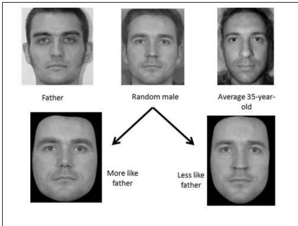
Figure 1. Example of stimulus construction