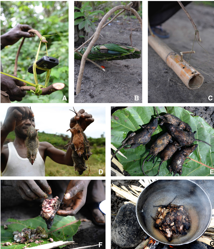
Figure 1. a Torley trap with mobile phone for scale, b kongoumie trap, c gbushie trap, d killed, e singed, f eviscerated, and g fried L. sikapusi and Mastomys spp.