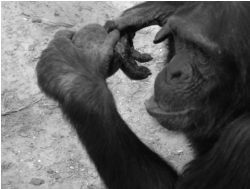
Bimanual coordinated feeding behaviour by a chimpanzee (Kambo) at Chimfunshi