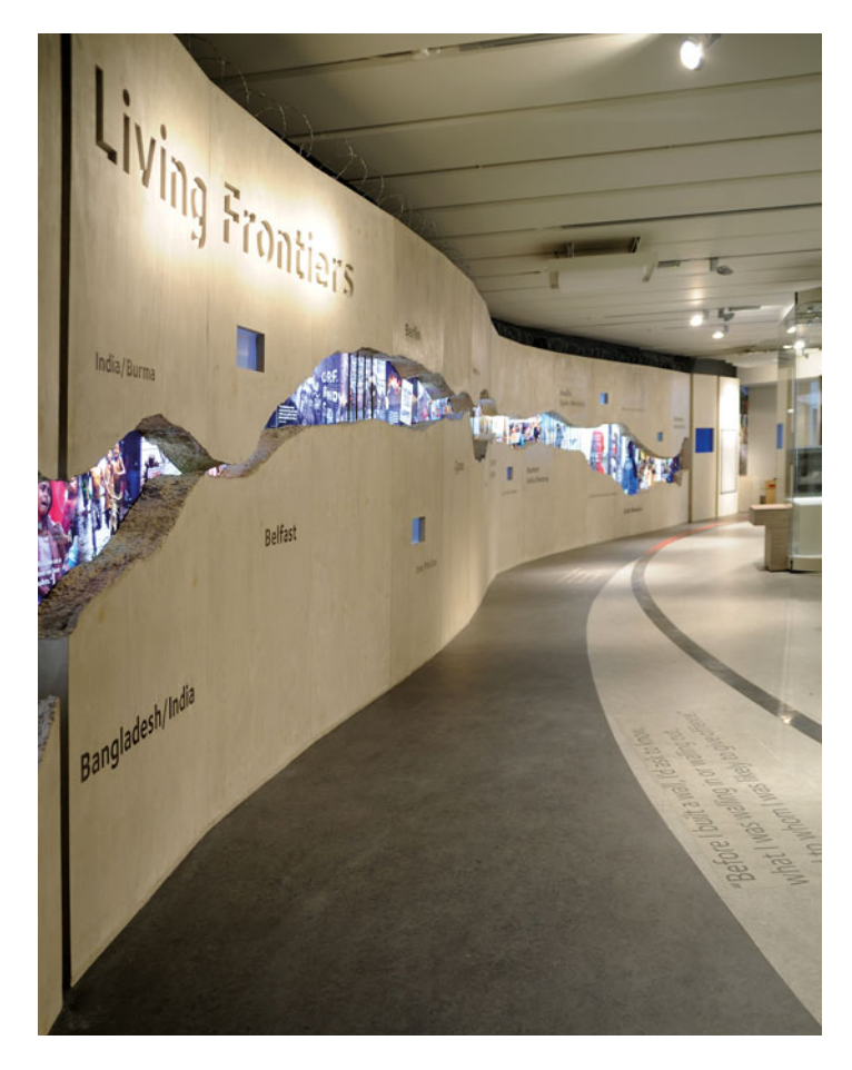
Figure 5. The Roman Frontier Gallery, The Living Wall, Tullie House Museum, Carlisle, England.

addressed in the public arena (see Labadi, 2010: 81). This may be seen as a negative message by many who seek to publicize the Roman frontiers for visitors, although it should be possible to adopt a more nuanced perspective that emphasizes the variable characters of frontiers and borders in both the past and the present.