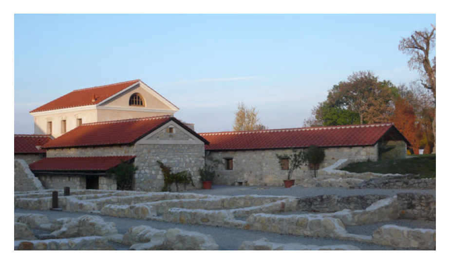
Figure 4. The Roman civil town at Carnuntum, Austria, showing buildings that have been reconstructed and displayed for the public.

also argue that 'border monuments and public art situated on or near borders are increasingly designed to celebrate cultural encounters and/or the ability of borders to connect as well as divide'. Festivals have publicized Hadrian's Wall as an inclusive