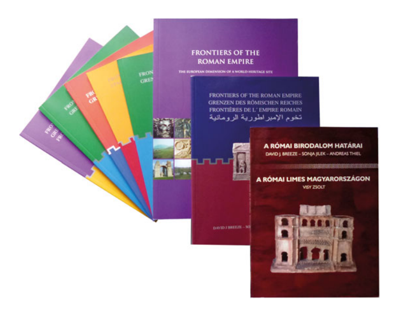
Figure 2. An assortment of publications derived from the Frontiers of the Roman Empire World Heritage Site initiative.

FREWHS (Figure 2; these include Breeze et al., 2008; Zsolt, 2008; Jilek et al., 2011; Mattingly et al., 2013). These document the ways that the physical character of the Roman frontiers varied according to local topography and the character of the societies encountered by the Roman administration in different parts of the Empire,<sup>5</sup> while also communicating the unified nature of the Roman frontiers as a whole. A directly co-operative agenda is outlined in all these publications, emphasizing the need for coordination but also for each State Party to follow its own approach in terms of understanding, protecting, managing, presenting, and interpreting its monuments (Breeze et al., 2005: 14-16). The FREWHS initiative has also created a separate body of literature focused on regional heritage practice, marketing, and