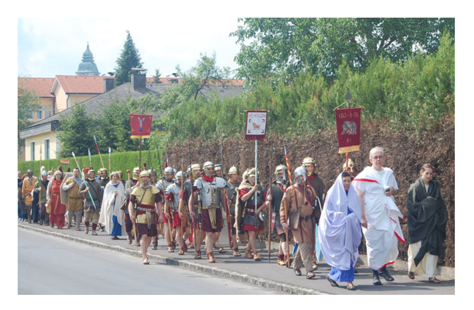
Figure 3. A re-enactment Roman event in the town of Enns, Austria.

the 117 km of this monument with a line of pulsating two-metre diameter lighted balloons, intended to encourage people to view the Wall as a bridge rather than a barrier (Cooper & Rumford 2013: 107, 120). Cooper and Rumford (2013: 114)