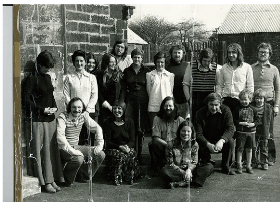
Figure 2 The CDP team c. 1975