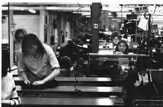
Figure 4 Women at work in the Levi Strauss clothing factory, 1976

The late 1960s to mid-1970s was the 'organizing stage' of the women's movement (Ryan, 1992) and some women CDP workers were actively involved in mobilizing women to create commitment (Gamson, 1975). This fitted with the CDP's politicizing objective, which was initially pursued through industry and employment work with the Trades Council, particularly the Working Women's Charter, drawn up by trade unionists and activists in the Women's Liberation Front and launched in 1974 (Saner, 2014). The Charter aimed to 'raise demands affecting women both as housewives and paid workers' (North Tyneside CDP, 1978b, p. 164). There were ten demands including equal pay, equal employment opportunities, maternity