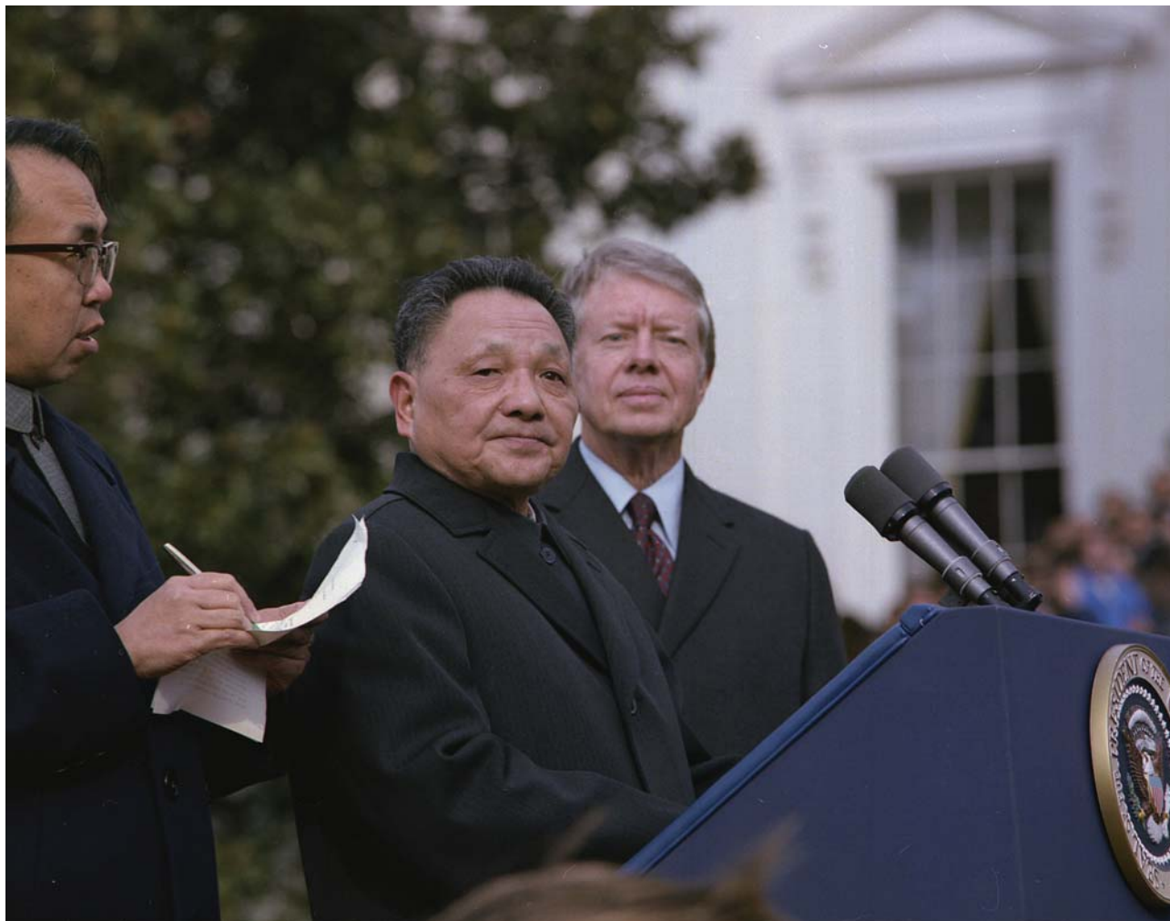
Deng Xiaoping with US President Jimmy Carter in 1979.

cause had it not been China, there could have been some other countries lining up to meet the binge consumption needs of the US. Yet, investment in infrastructure in the UK/US in order to buy back some good opinions is not remotely unrelated.