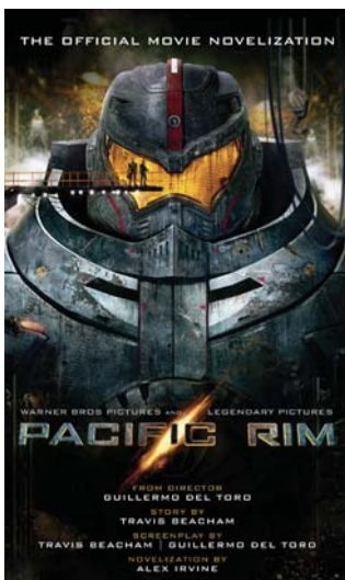
Pacific Rim , American science fiction film

Not long ago, Pacific Rim , an American science fiction film was released in 2013. The story line was especially simple. Basically the world was attacked by a gigantic monster called Kaijus (strange beasts) emerging from the Pacific Ocean. Human beings were on the brink of being annihilated because they could not protect themselves from the huge monsters. Eventually, they created Jaegers (huge humanoid robots) to fight against the monsters. At last, the Jaegers won the war. Again, other than criticizing it as another tacky and so predictable Hollywood film, the lesson behind the film for the global finance is that when a