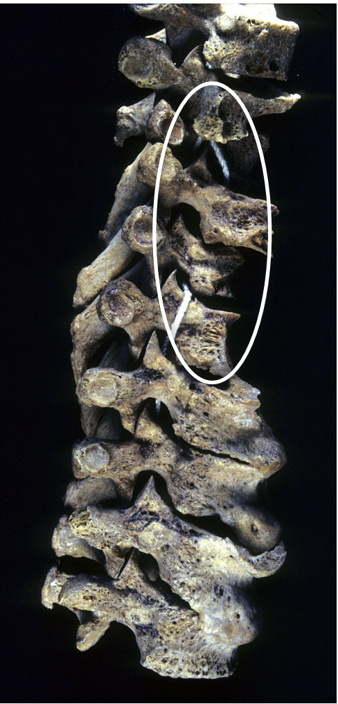
Fig. 3. Tuberculosis in the spine of skeleton 181, Robert J Terry Collection, Department of Anthropology, National Museum of Natural History, Smithsonian Institution, Washington DC (affected vertebrae circled – destruction of vertebral bodies).