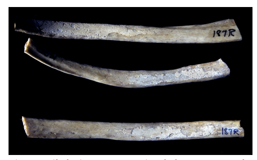
Fig. 2. Rib lesions as seen in skeleton 187, Robert J Terry Collection, Department of Anthropology, National Museum of Natural History, Smithsonian Institution, Washington DC (lighter new bone formation).

tory disease in skeletal remains relies on observing inflammatory new bone formation in the maxillary sinuses and on the visceral/internal surfaces of the ribs (Figs 1 and 2). Of note is the general inability for the (often) subtle bone changes in the sinuses and on the ribs to be recognised by a clinician; even a radiograph may not detect these bone changes.