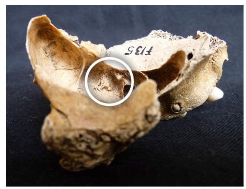
Fig. 1. Maxillary sinusitis in a 12th–16th century person (135) from Fishergate House, York, England (circled).

Respiratory health can be affected by many factors in a person or population's environment, including disease, but indoor and outdoor 'pollution' leading to poor air quality has been shown to be a key driver for poor health (http:// www.who.int/respiratory/en/). Indeed, Hippocrates in the 5<sup>th</sup> century BC talked about the importance of clean air in his "Airs, waters and places". The quality of air that we breathe can affect health in many ways. The body cells need energy and that energy is derived from chemical reactions for which oxygen is essential. The respiratory system provides a route for oxygen to enter the body and for carbon dioxide to be excreted (Wilson 1990:123). Particulates that can 'pollute' the respiratory system may be inert (carbon, diesel exhaust), allergens (house dust mite, pollen), or living organisms (bacteria, viruses), alongside gases that are organic (e.g. sulphur dioxide) or inorganic (e.g. tobacco smoke). Furthermore, 'pollution' may be naturally (e.g. volcanic eruptions) or human induced (e.g. car emissions). Detecting respira-