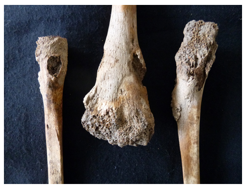
Fig. 8. Elbow joint showing bone formation and destruction from a 12–14 year old person buried in a post-medieval cemetery in North Shields, Tyne and Wear, England.

ty, attracted stigma (facial swelling, oral discharge), and could lead to septicaemia and even death. It is possible that phosphorus inhalation also caused the rib lesions evident in this skeleton. Clearly this is a very specific occupationally related disease but shows the environmental effects of the work environment.