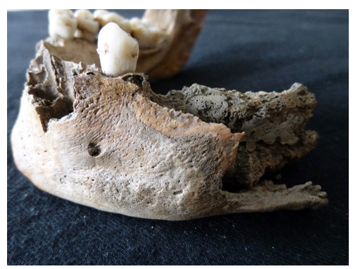
Fig. 7. Mandible showing bone formation and destruction from a 12–14 year old person buried in a post-medieval cemetery in North Shields, Tyne and Wear, England, likely illustrating 'phossy jaw'.