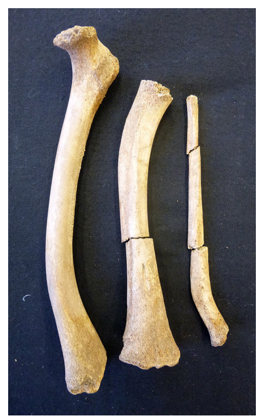
Fig. 5. Rickets in the lower limb long bones of skeleton 75 (3–4 years old) from Coach Lane, North Shields, Tyne and Wear, England.

news/article-2543724/Rickets-soar-children-stay-indoors-Number-diagnoseddisease-quadruples-ten-years.html), and it is exposure to sunlight that is known to be the main source of vitamin D. Children staying indoors for long periods of time, or being protected excessively from the sun by sun cream, are risk factors. While some foods, such as oily fish, have high levels of this vitamin, they do not provide the amounts that are comparable to those derived via exposure to ultraviolet light. It has also been established that vitamin D treatments can decrease the risk of many diseases such as cancers and infectious diseases (Holick ibid). Other