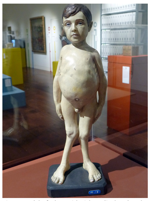
Fig. 4. Model of a boy with rickets displayed at the Wellcome Trust Collections. London.

Another environmental factor that can be detrimental to people's health is lack of exposure to ultraviolet light and a consequent deficiency in vitamin D. This vitamin is produced in the skin due to the action of UV light and its presence enables calcium and phosphorous to be absorbed into the bones to make them strong. Lack of vitamin D leads to rickets (or osteomalacia in adults) and 'soft' unmineralised bones (Figures 4 and 5). Rickets is becoming an increasing problem today for the world's children (Holick 2007; http://www.dailymail.co.uk/