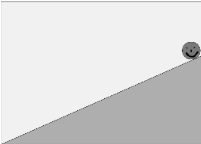
Figure 1. Depiction of the animation stimuli used in the Pantomime task. The circle (or square) either bounced or rolled up or down the slope. The original stimuli were in color (see the Supplementary Material).

The stimuli were eight animation clips of a motion event, depicting either a smiling square or circle on a green 'hill' slope against a blue 'sky' background (Figure 1). Manner and path of the motion event were presented simultaneously, with the shape either ascending or descending the slope, while performing either eleven bounces or rotations. The eight different clips represented all combinations of the following features: the square or circle shape, rolling or bouncing (motion), up or down the slope (path).