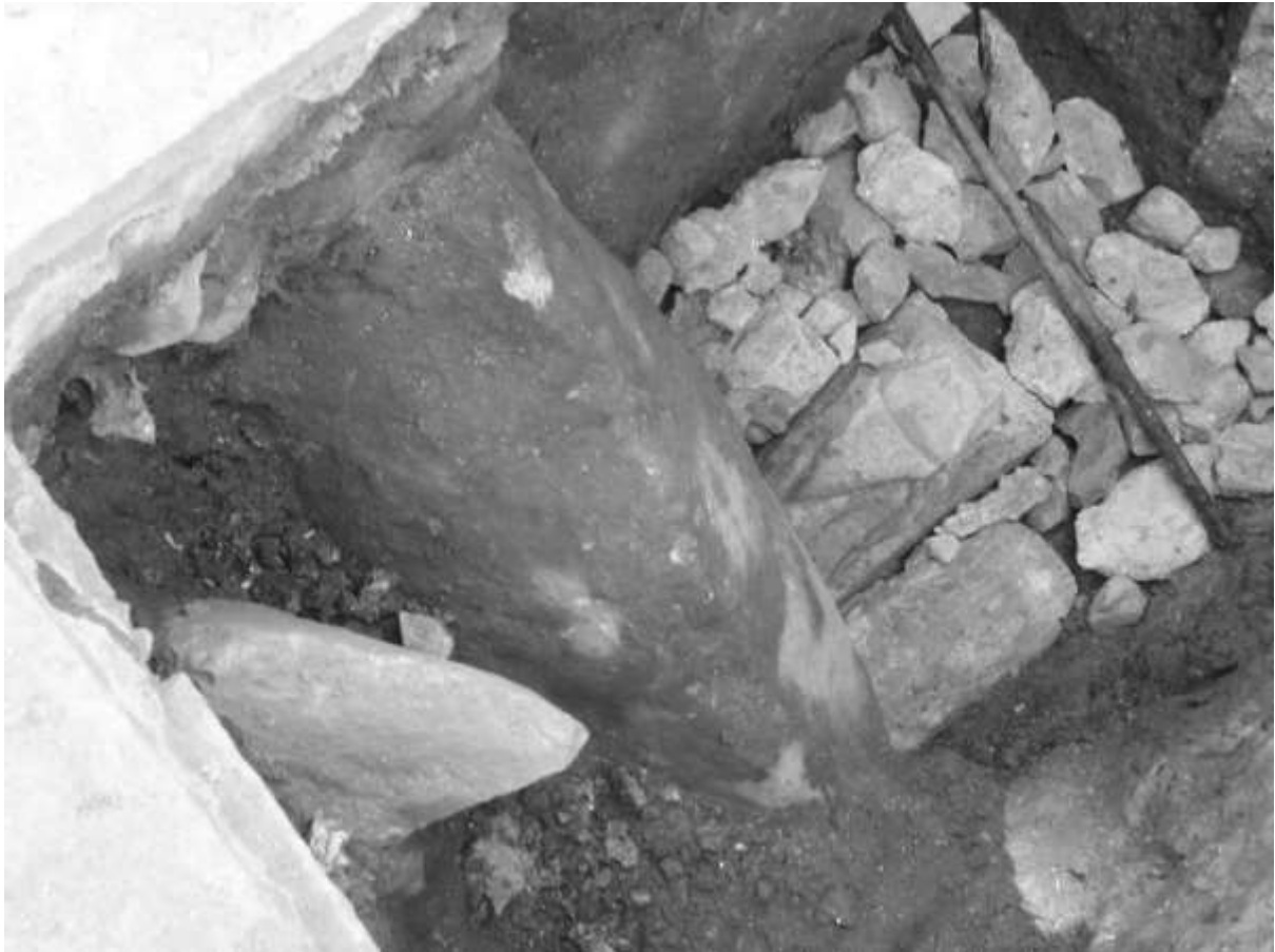
Figure 6: Unrecorded cut adjacent to a temple platform in Hanuman Dhoka Durbar Square for the installation of a lamppost.