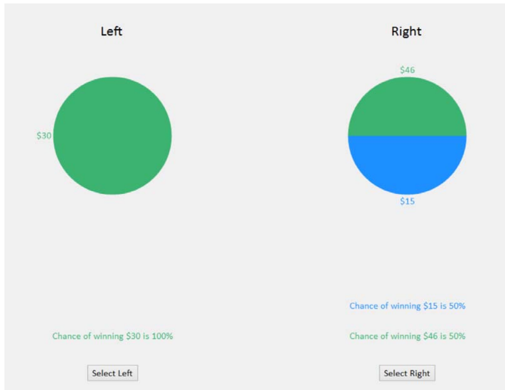
Figure 1: Binary Choice Display