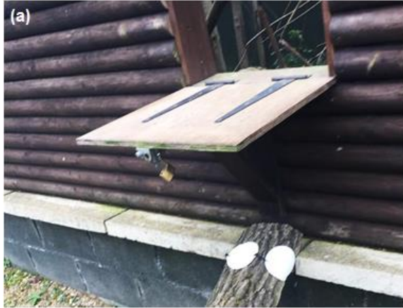
Fig. I. Sterile filter paper attached to popular scent-marking locations using plastic cable ties. (a) hatches, (b) climbing frame equipment, (c) tree branches.