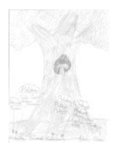
Fig.2. Ralph's local map with the school; his house; skate park; playground and shop.

Fig. 1 Ralph's tree of attachment: In the roots from the left side: Scotland – Mum; Poland – Dad, Brother, Grandma, Grandpa; Poland – fiends; Scotland – fiends; two homes.