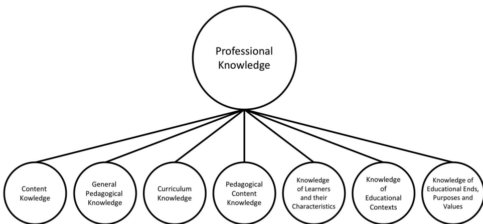
Figure 1. Teacher professional knowledge according to Shulman (1987).

In a retrospective, 20 years later, Shulman emphasises two original features of PCK. First, PCK is the missing link between CK and PK; and second, PCK was intended to capture subject pedagogy as the main constituent feature of teaching, and of teaching a specific subject (Berry, Loughran, & van Driel, 2008). The idea of PCK as the central component of teachers' professional knowledge has received increasing acceptance (Berry, Depaepe, & van Driel, 2016). Nevertheless, there remains less agreement, however, about what PCK actually is .