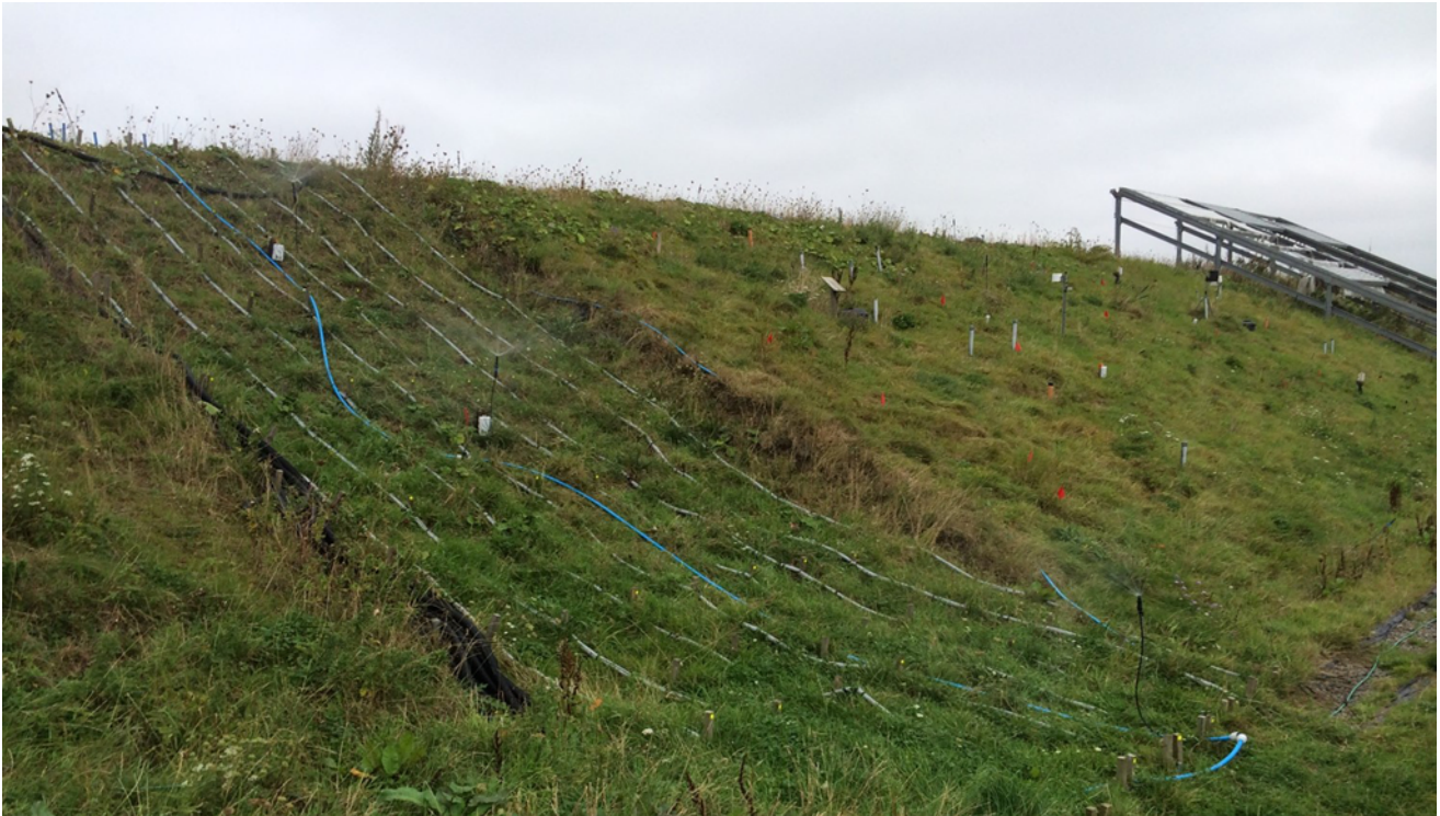
Fig. 1. BIONICS research embankment, Northumberland, UK. The facility has been used to understand earthworks behaviour in relation to climate and test new instrumentation approaches.

mean it is now possible to send significant quantities of data via mobile phone networks. Local wireless data networks that transmit between adjacent monitoring nodes are also becoming commonplace, and are particularly helpful in geographically diverse systems.