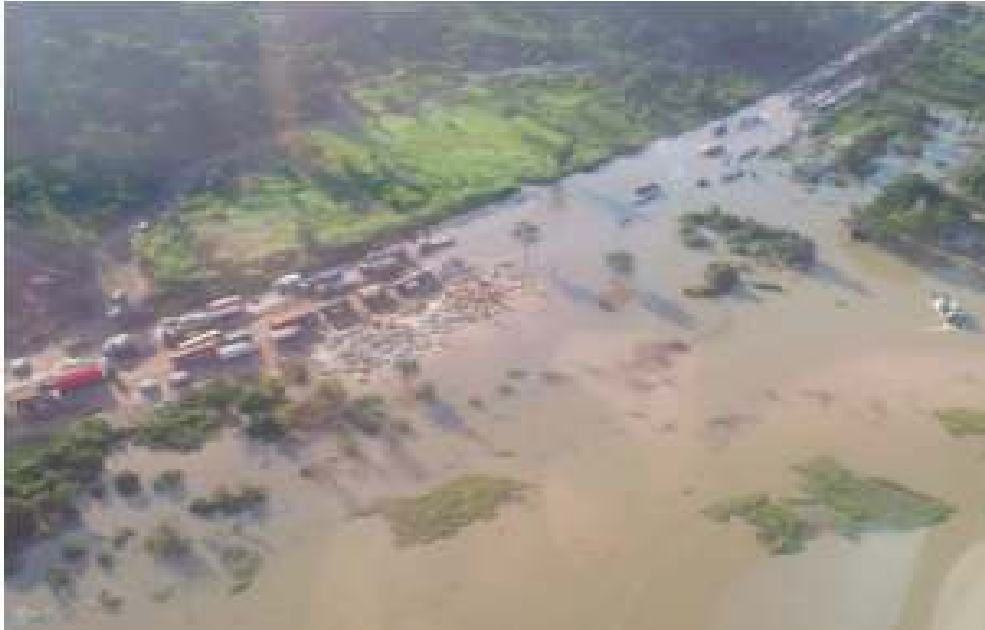
Plate 3. Severed major transportation route (Lokoja-Abuja) in Lokoja left travelers stranded Source [46]