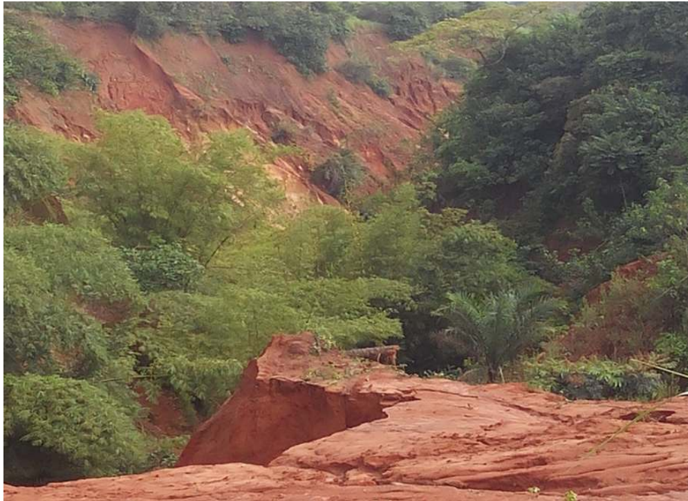
Plate 1. Severe gully site, Umueshi, Imo State, Nigeria

the crude protein content of cassava by 40 percent. These they observed could result in a 24 percent increase in the prevalence of childhood malnutrition. The authors concluded that oil spills in the Niger delta region have acute and long-term effects on human health.