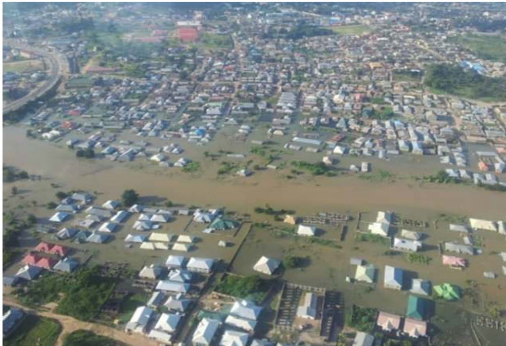
Plate 2. Submerged houses along Niger River in Lokoja