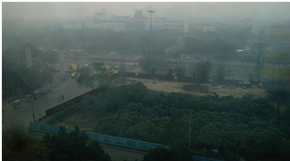
Fig. 1. Morning smog, Greater Noida.

The smog was not the only form of material obfuscation to be found during the week. COP7 delegates might have noticed, for example, the signs plastered on bus shelters