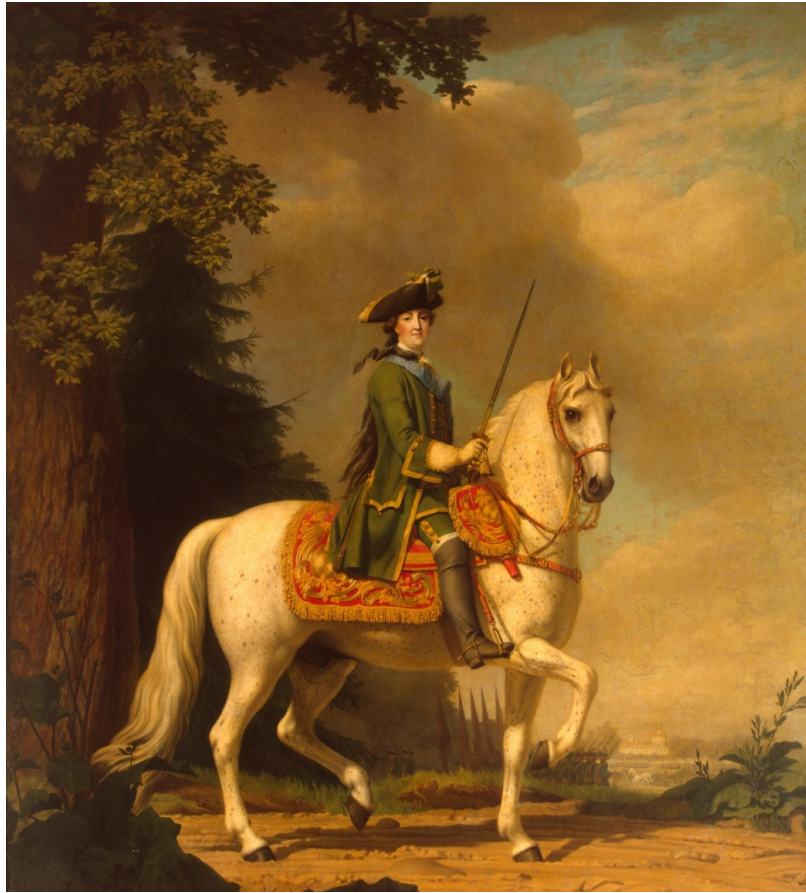
Image 4: Vigilius Eriksen (Ericksen). Equestrian Portrait of Catherine II , Denmark, after 1762. Oil on canvas, 195cm x 178.3cm. Inventory Number GE-1312.

"The empress led the regiments herself dressed in the Preobrazhenskii Life Guards uniform, on a white horse holding a drawn sword in her right hand." 10