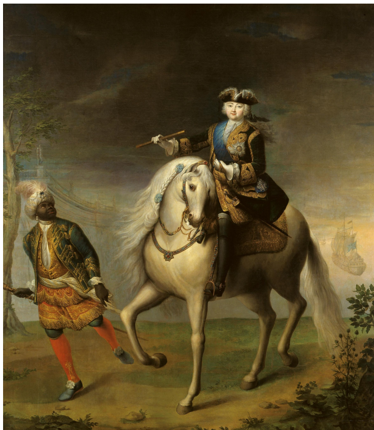
Image 9: Anonymous Artist, Equestrian Portrait of Empress Elizabeth , eighteenth century, Russia. The painter of the original was Georg Christoph Grooth. Oil on canvas, 330cm x 290cm. Inventory Number ERZh-3286.

details of their costumes, along with what appears to be a simple and delicate high Palladian wall that features curved contours, are reminiscent of the vessel with the ensign of the Russian Navy in the background. The controlled trot of Elizabeth's horse is reminiscent of Catherine's mount in Eriksen's portrait.