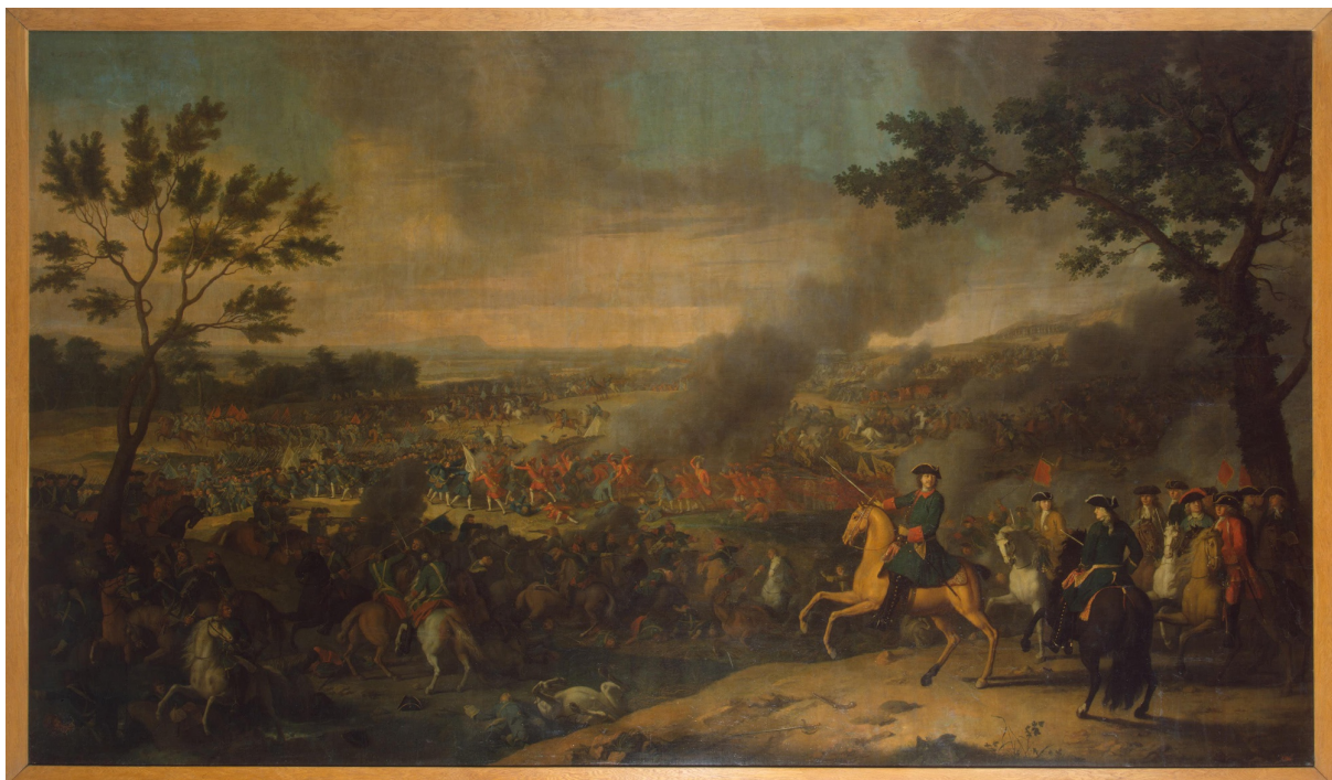
Image 6: Louis Caravaque, The Battle of Poltava , France, 1718. Oil on canvas, 281cm x 487cm. Inventory Number ERZh-1913.

Many eighteenth-century works of art, which commemorated the events of the Battle of Poltava (1709), depicted Peter I in the Preobrazhenskii uniform with red decorative elements. Such works include Louis Caravaque's painting of 1718 (Image 6) and a tapestry created by Philippe Behagle the Younger and Ivan Kobylyakov between 1719-1722 (image 7), which was possibly based on Caravaque's drawing. In the 1720s, etchings by the artists Nicolas de Larmessin IV and Charles Louis Simonneau the Elder, and a painting by Johann Gottfried Tannauer, also depicted Peter I in the uniform of the Preobrazhenskii Regiment at Poltava. 66 These works follow the iconography of paintings from the sixteenth and seventeenth centuries that depicted battle scenes. They portray Peter I on a rearing horse, oftentimes on a hilltop, with the battlefield in the background. 67