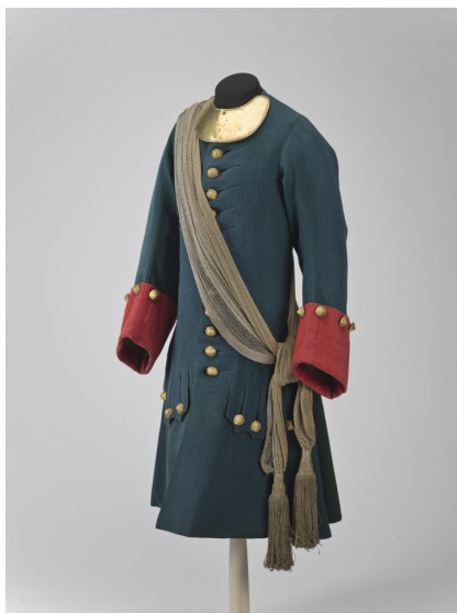
Image 5: The uniform of Peter I modeled on the officers' uniform of the Preobrazhenskii Life Guards Regiment, Russia, 1701-1709. Length of the back – 116cm. Inventory Number ERT-16753.