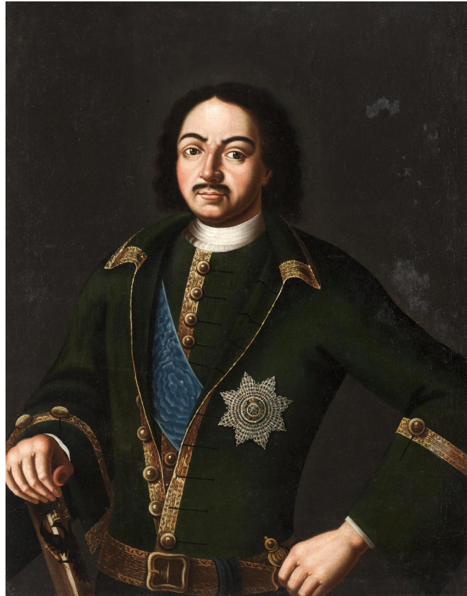
Image 8: Portrait of Emperor Peter the Great in a Green Caftan with Gold Galloon and the Star of the Order of St Andrew . Russia, eighteenth century. Oil on canvas. 103.5cm x 80cm. Inventory Number ERZh-530.

number of portraits painted by unknown artists in the style of Caravaque depicted the tsar in the green Preobrazhenskii uniform with gold galloon. 80