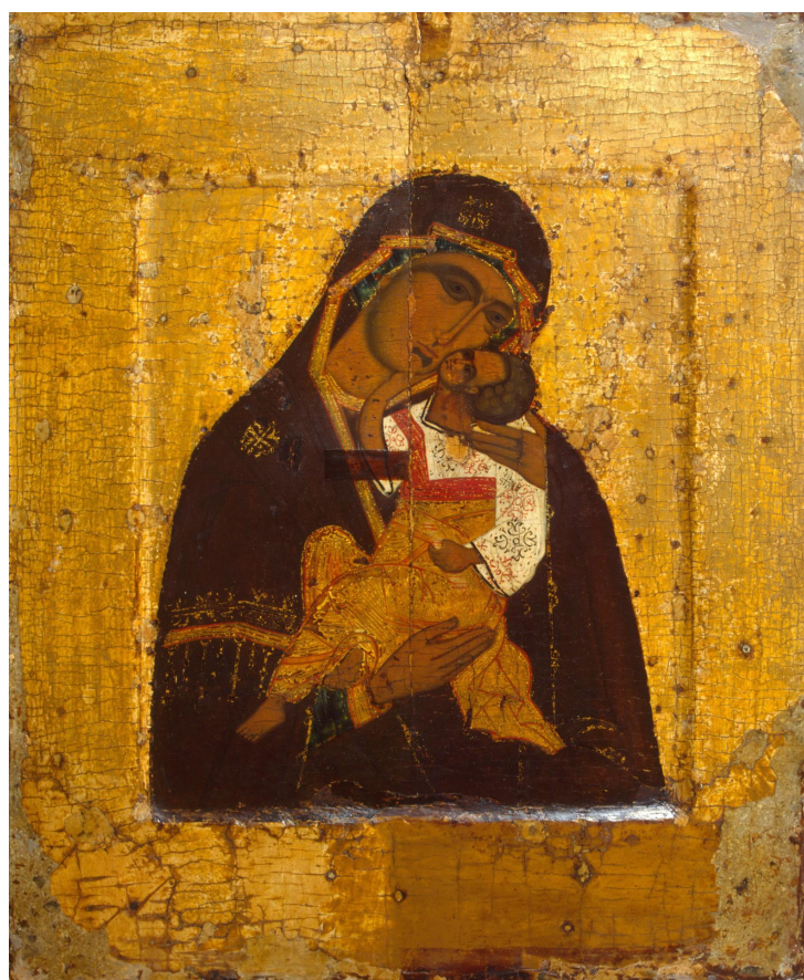
Image 11: The Mother of God of Tenderness . Russia, second half of the 16 th century. Tempera on panel. 33.8cm x 28cm. Inventory Number ERI-144.

the artist perhaps subtly revealing to the viewers which of the two uniforms Catherine was wearing and in his artistic interpretation of this episode, suggesting the presence of divine guidance. In this respect, Russian sovereigns including both Peter I and Catherine II enacted this kind of monism, which, as Vatro Murvar notes, did not make a “distinction between religious and political, spiritual and temporal” spheres and relied on romanticizing messianic qualities of the sovereigns. 94 Yet, this monism does not contain internal contradictions within the Orthodoxy and Eastern Christianity because Christ as “the divine Logos, as God” is seen as “born eternally from the Father” and “in time as the human child of a human mother.” He is one person in a duality of natures and hypostases, “ homooousios (of the same substance/ essence) to the rest of humanity and homooousios to the Father and the Holy Spirit,” and thus, possesses both human and divine attributes similarly to the Theotokos, and believers are invited “to participate in Christ’s divinity to attain a more authentic humanity” and to achieve universal salvation. 95 In this context, it is important to mention that the etymology of the word krest’ianin [a peasant] is suggestive of christianos .