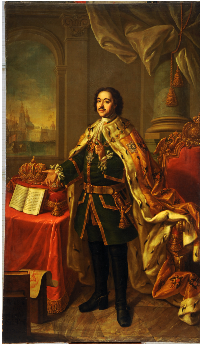
Image 10: Aleksei P. Antropov, Portrait of Peter I , Russia, 1770. Oil on canvas, 268cm x 159cm. Inventory number Zh-25.

the uniform was used to enhance a sense of historical and dynastic continuity; to display the commitment of monarchs to cultural and national traditions and to promote their roles as protectors of the people and their faith.