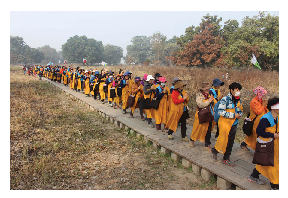
Figure 6. Pilgrims visiting Tilaurakot using the new non-intrusive walkway, Nepal.

being installed, which allow visitors to walk over sensitive archaeology, negating damage from increased footfall (Figure 6). Such interventions can aid the protection of heritage, whilst also facilitating continued sustainable growth and the economic benefits of large temporary populations at sites with a long tradition of temporary gatherings and pilgrimage in South Asia.