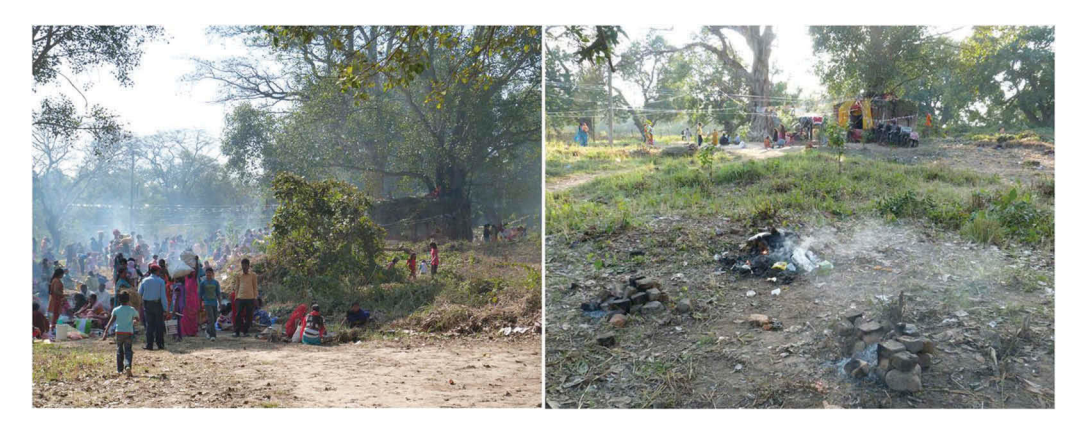
Figure 1. Cooking of food and offerings at the Samai Mai temple, Tilaurakot, Nepal (left) and remnants of temporary stoves after the festival (right).

Further complications arise in addressing when these practices may have been undertaken and the numbers of people involved. For instance in Nepal, at Tilaurakot, a candidate site for ancient Kapilavastu, the childhood home of the Buddha, a local shrine to the deity Samai Mai is visited by local communities throughout the year. The frequency and volume of visits increase during festivities for the arrival of spring in late January/early February. During this festival period, family groups from the local area come to venerate the shrine. Cooking food and preparing offerings during their visit, each group creates a temporary stove for this purpose, spatially radiating out from the shrine. The increase in the 'footprint' of the shrine's area during these festival days is not permanent and the definition of space of activity would not be possible to identify archaeologically. Within a few weeks, the traces left by these large temporary gatherings, including stoves built from loose bricks, are cleared away or vanish within the growth of new vegetation (Figure 1).