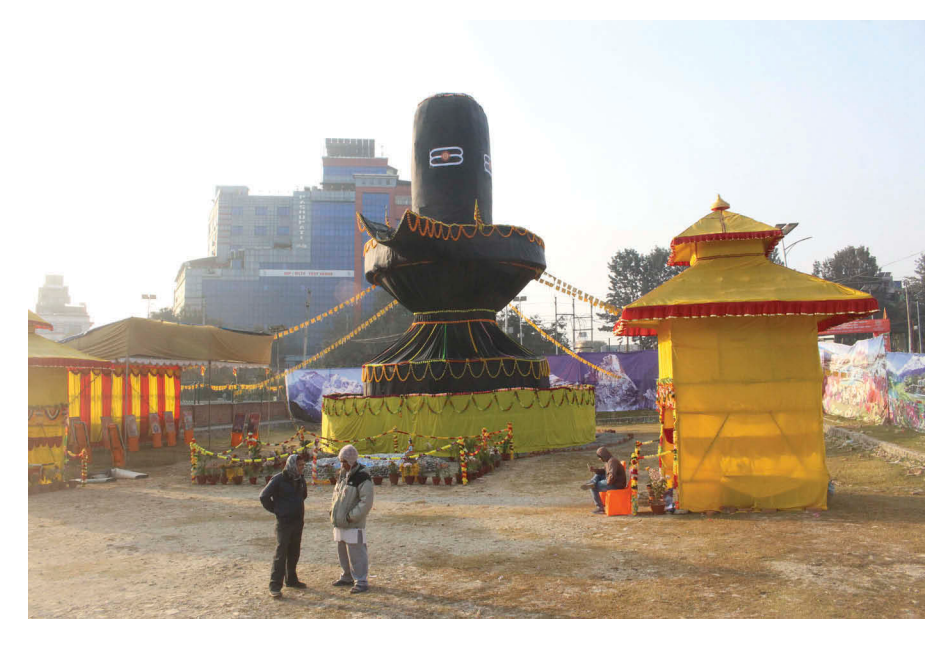
Figure 5. Temporary monumental Shivalinga erected for Bala Chaturdashi, Pashupatinath, Nepal.

coinciding with festivals and events, these vestiges are then dismantled. These non-permanent and seasonal structures and monuments, and their uses by people, are potentially missing from archaeological observations, particularly those that traditionally focus on durable, and aboveground, architectural remains. Whilst discussing Pashupatinath, it must also be noted that it is not only pilgrims who travel through the landscape to visit and gather at religious sites – so too do religious practitioners. Pilgrimage locales can become gathering places for usually dispersed communities, such as wandering ascetics and networks of pilgrimage, often linked to sacred calendars, enable travelling renouncers to periodically gather at predetermined locations, facilitating ritual interaction and economic support systems for renouncers and their followers (Hausner 2007, 105). At Pashupatinath, Sadhus throughout South Asia congregate throughout the year, most spectacularly at Shivaratri, where in 2016 over 5000 Sadhus were recorded amongst the 1.5 million pilgrims who visited in a two-week period (EKantipur 2016). At the end of these festivals, physical evidence of these large gatherings almost vanishes with temporary structures dismantled and pilgrims and Sadhus dispersing from the site back to their communities or wandering lifestyles.