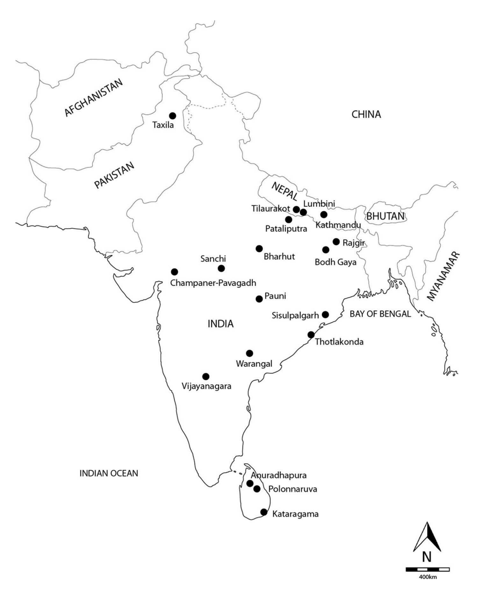
Figure 2. Map of sites mentioned in the text.

BCE), and established across South Asia (Falk 2006), not only provides insights into the sociopolitical organization and the territorial extent of this major regional power (Smith 2005), but also evidence of patronage. A prime example is the text engraved on the pillar at Lumbini, erected in commemoration of Asoka's personal pilgrimage to the site, which states: