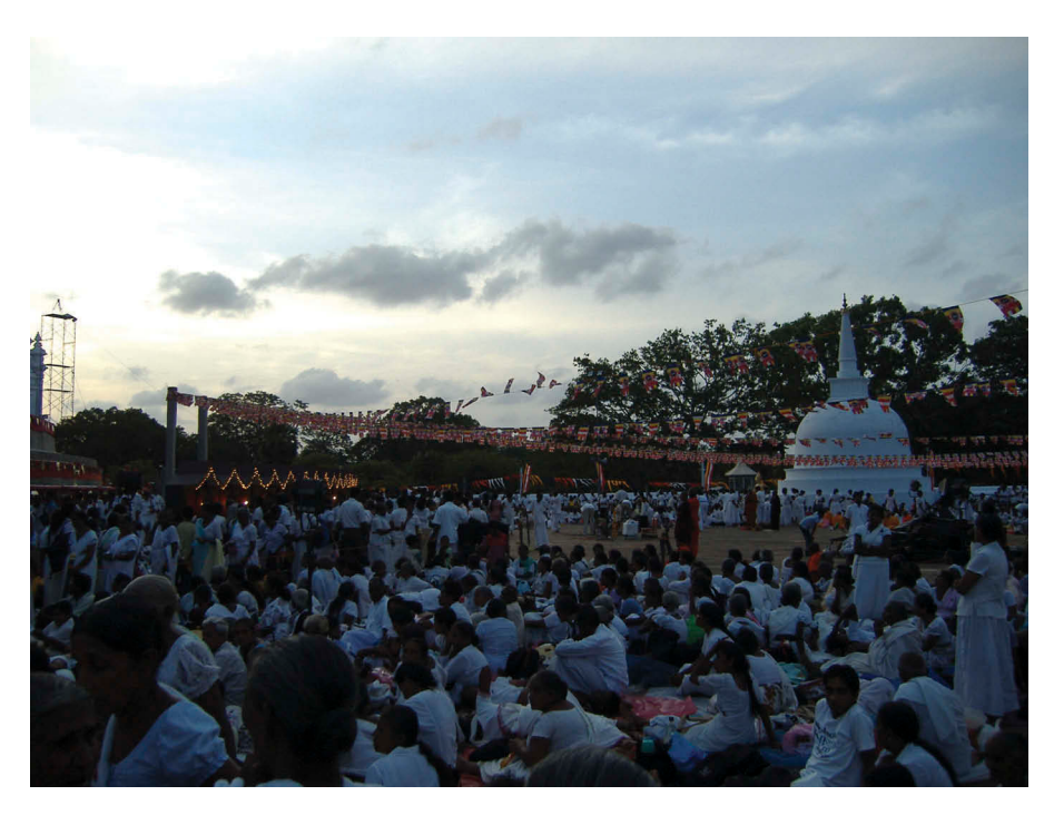
Figure 3. Pilgrims gathering on the terrace of the stupa of Ruvanvelisaya, Anuradhapura, Sri Lanka.

twentieth centuries, with 25,000 people recorded at a festival in 1897 and an attendance of 200,000 people at the enshrining of relics at Ruvanvelisaya stupa in 1932 (Nissan 1988, 256).