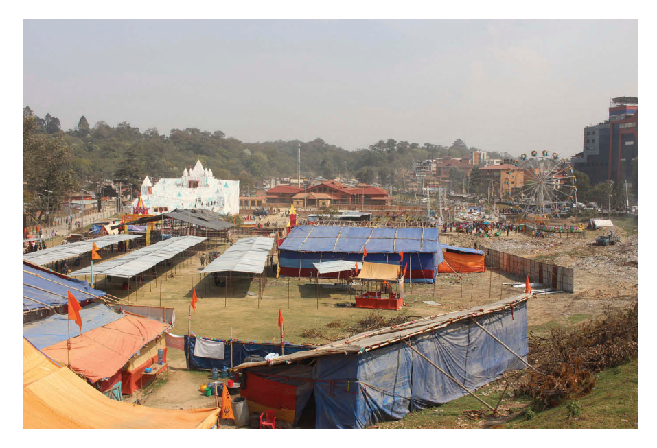
Figure 4. Temporary temple complex erected for Shivaratri at Pashupatinath, Nepal.

Sometimes completely new temples are erected during festivals. During Shivaratri at Pashupatinath temple, in Nepal, a large temporary temple, constructed of bamboo and plastic, is built within the monument complex to accommodate the influx of pilgrims who wish to attend temples and the temporary markets set up during the festival (Figure 4). Further examples of such temporary structures are found throughout the year at Pashupatinath, including a Shivalinga constructed from fabric, which was built during observances for Bala Chaturdashi, when those who have died within the past year are remembered (Figure 5). Erected for short time periods