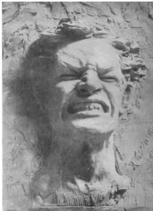
No. 1.—Violent Effort