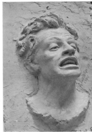
No. 4.—Advanced Fatigue.