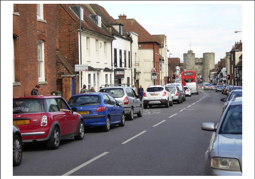
Figure 2. Example of queuing traffic when barriers are down.

level crossing is located in the shopping district in the city center on a road lined with shops and cafes. It is part of a major through route to the rail station and to the main city center bus stops. As such, it is heavily congested by both road traffic and pedestrians. During the period in which these experiments were conducted, the annual mean concentration of nitrogen dioxide at our level-crossing site was 39 \mu\text{g}/\text{m}^3 (Medway Council, 2013) only just meeting the European Commission Air Quality target of 40 \mu\text{g}/\text{m}^3 (European Commission, 2014). To encourage drivers to turn off their engines while waiting at the level crossing, Canterbury City Council had placed a permanent sign at the crossing (see Figure 3). Although some research suggests that signs alone can change behavior (e.g., McNees, Egli, Marshall, Schnelle, & Risley, 1976; Thurber & Snow, 1980), the message on this sign was designed simply to be an informational request and was not guided by any particular behavioral theory (Canterbury City Council, personal communication, November 3, 2016). Perhaps, owing to the absence of surveillance cues, the existing sign produced low levels of compliance (see baselines). In these experiments, we implemented additional types of surveillance cues in an attempt to increase compliance with the instruction to switch off engines.