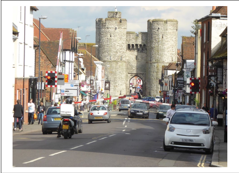
Figure 1. The level crossing and surrounding area.

stake, because maintaining a reputation as a cooperative person is necessary for survival in a social system (Burnham & Hare, 2007; Haley & Fessler, 2005). Thus, subtle surveillance cues, such as the watching eyes, can induce cooperative behavior. Subsequent research has shown that images of eyes can increase people's donations to a charity bucket (Powell, Roberts, & Nettle, 2012), their decisions to recycle appropriately (Francey & Bergmuller, 2012), reduce their littering (Bateson, Callow, Holmes, Redmond Roche, & Nettle, 2013; Ernest-Jones, Nettle, & Bateson, 2011), and deter them from stealing from public bicycle racks (Nettle, Nott, & Bateson, 2012). Even eye-like spots displayed on a computer screen have been shown to increase cooperative behavior within economic games (Haley & Fessler, 2005; Rigdon, Ishii, Watabe, & Kitayama, 2009).