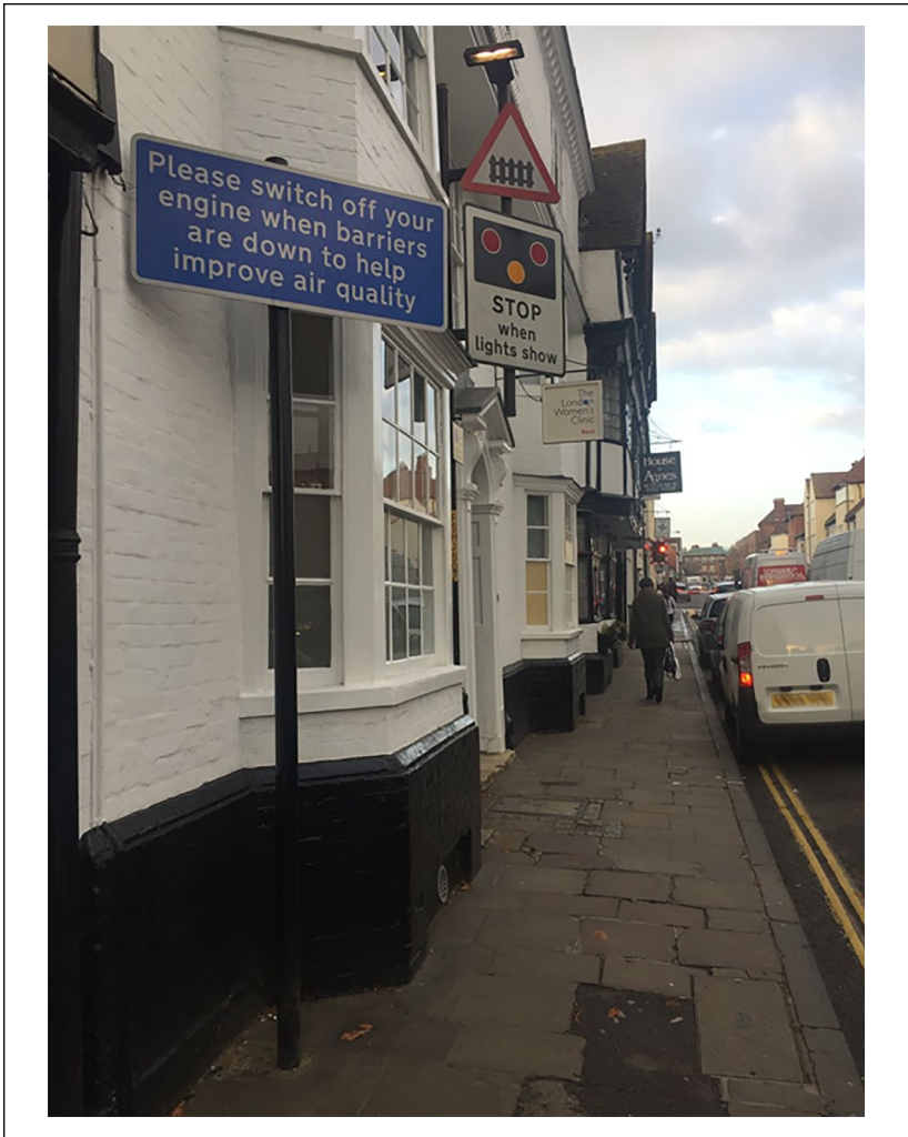
Figure 3. Permanent sign at the level-crossing site, placed by the local council.