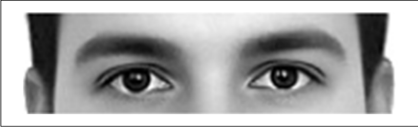
Figure 4. “Watching Eyes” manipulation (Experiment 1).

to the railway level crossing. After the barrier dropped and vehicles were all stationary, research assistants walked along the sidewalk, recording whether each vehicle’s engine was on or off.