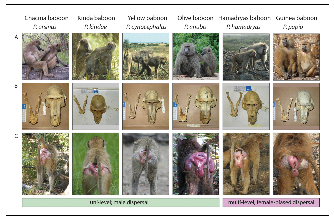
Figure 2. Illustration of key traits across baboon species. (A) Phenotypic variation between species. Pictures show adult males and females. (B) Crania of male baboons. (C) Sexual swellings of female baboon during peak estrus. Species are grouped by social organization (uni- and multi-level) and dispersal behavior (male- or female-biased dispersal).

DOI: https://doi.org/10.7554/eLife.50989.004