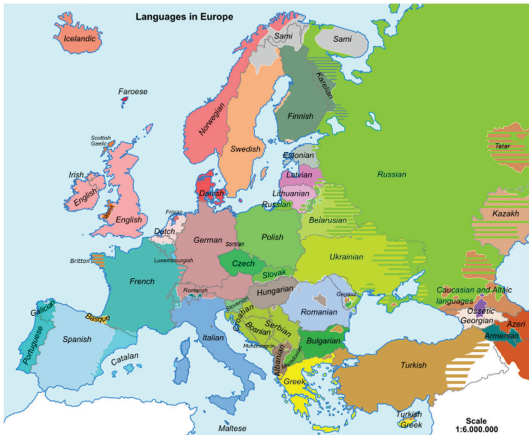
Figure 2: Map of languages in Europe