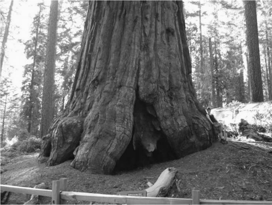
The Robert E. Lee tree in Kings Canyon National Park is one of four California redwoods named for the rebel general.