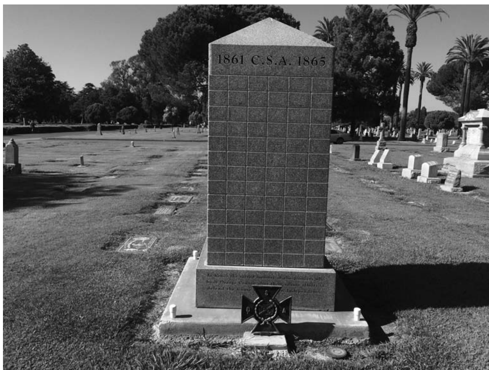
The Sons of Confederate Veterans erected this nine-foot granite monument to the rebel veterans of Orange County in 2004. It stood in Santa Ana Cemetery until its removal in August 2019.

One of the most audacious Confederate monuments in the West was erected as recently as May 2004. It was a curious one: a nine-foot granite pillar in an Orange County cemetery bearing the names of numerous rebels, including some, like Stonewall Jackson, who had never set foot in the state. Inscribed on the monument's pedestal was characteristic Lost Cause rhetoric, with a Western twist: "to honor the sacred memory of the pioneers who built Orange County after their valiant effort to defend the Cause of Southern Independence." Some of these Confederate veterans were buried in the Santa Ana cemetery where the monument stood. In this regard, the Orange County marker was not unlike the Hollywood memorial, erected nearly a century earlier. Also like the Hollywood marker, it drew little criticism when a local Confederate memorial association unveiled it. The dedication ceremony, organized by the Sons of Confederate Veterans, was a celebratory affair, with patrons and supporters posing proudly for the occasion in period costume, including Confederate gray. 45