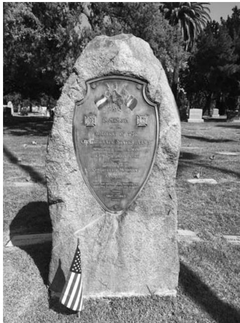
Erected in 1925, this memorial to Confederate soldiers "who have died or may die on the Pacific coast" stood in Hollywood Forever Cemetery until 2017. It was removed shortly after the white supremacist riot in Charlottesville, Virginia, that August.

Given its long proslavery history and enduring Southern connections, Los Angeles was a fitting location for the West's first major Confederate memorial. In 1925, the Confederate Monument Association of Los Angeles, in conjunction with the UDC, erected a six-foot granite structure in Hollywood Cemetery. It was a tribute to the wartime services of several dozen Confederate veterans who settled in the region after the war and took their final rest under Southern California soil. 26 In anticipation of the monument's unveiling, California chapters of the UDC hosted several large gatherings. That spring in Pasadena, for instance, a hundred Southern women, "all bubbling with typical Southern hospitality," hosted the president of the UDC, who entertained the crowd with "a number of southern stories in the negro dialect," according to the Los Angeles Times . 27 The UDC and the Confederate Monument Association of Los Angeles would eventually purchase seventy-five plots around the monument for soldiers and their families. For years to come, the region's memorial associations decorated the graves of their fallen soldiers and hosted commemorative gatherings on the cemetery plot. 28