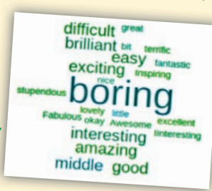
Figure 6 'How would you describe science?' Pupils' responses in Summer 2018

Figure 5 'How would you describe science?' Pupils' responses in Autumn 2017