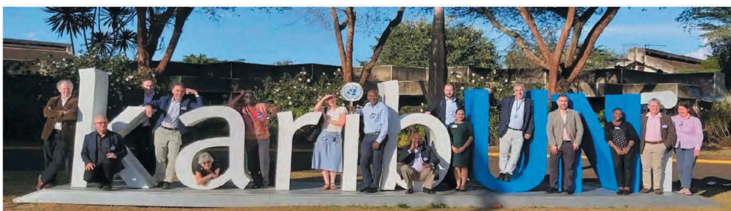
Figure 2. BOVA Network management board at UN-Habitat, Nairobi.

Remarkably little research has been done on mosquito behaviour in and around the home. This is surprising given that up to 80% of malaria transmission in SSA