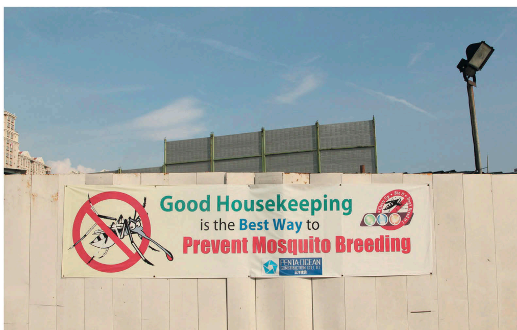
Figure 6. Environmental management _construction site Singapore.