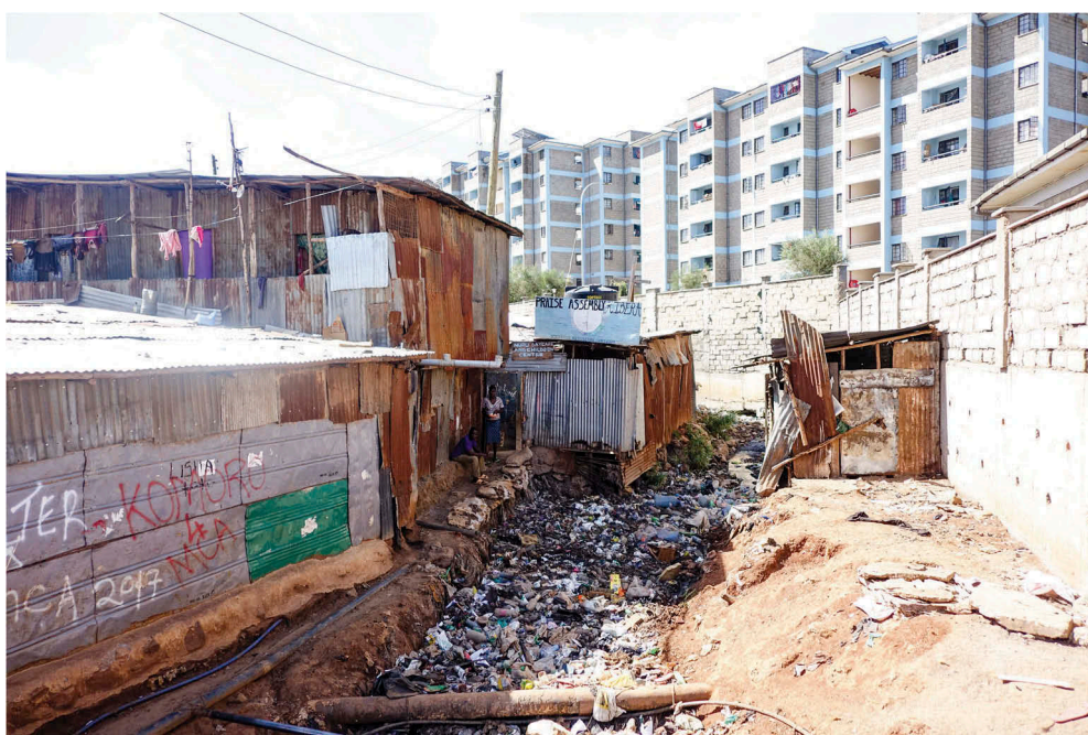
Figure 1. Large scale newbuilds replacing slums in Kibera, Nairobi.

Recently it has been acknowledged that we must rely less on insecticide-based approaches and adopt multi-sectoral strategies to control mosquito transmitted diseases (WHO 2017). In 2015 Roll Back Malaria, the United Nation's (UN) Development Programme and UN-Habitat produced a consensus statement (Roll Back Malaria, UN Development Programme, UN Human Settlements Programme 2015) outlining the key research questions that should be addressed to help reduce the threat of VBDs through housing improvements. Since then research in this important area has expanded and the focus has been broadened to the built environment, not just housing. The BOVA