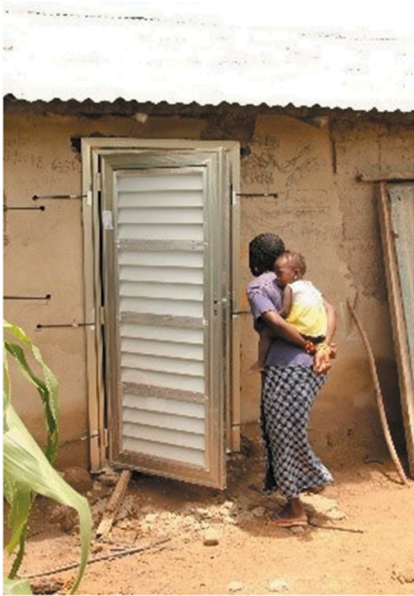
Figure 4. Prototype mosquito-proof door which allows ventilation.

scalable. Having established ‘what is out there’, these should be tested and evaluated to demonstrate protection against mosquitoes. House design and materials should, of course, be considered in relation to the cultural setting, including an understanding of what people desire of their homes, and how people use the space both inside and immediately outside their houses. Ultimately updated guidelines need to be produced that include well-tested approaches that can be employed in different settings.