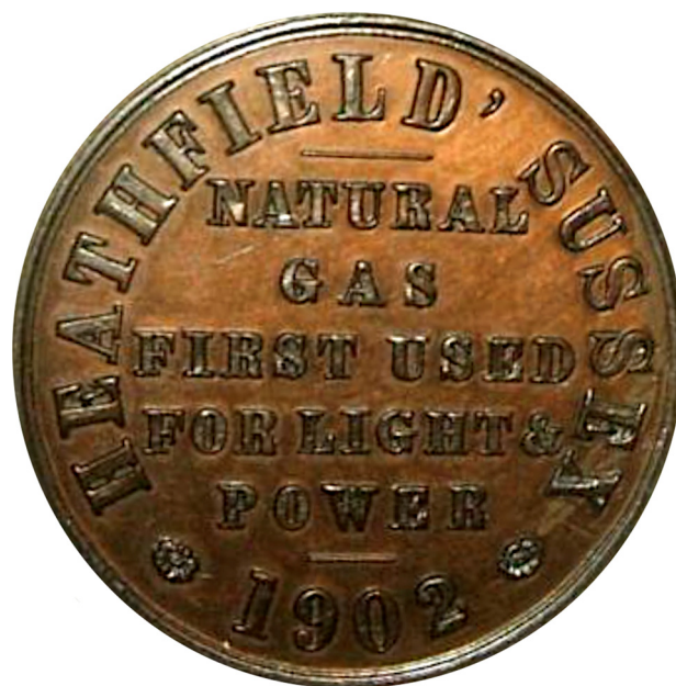
Fig. 3. Reverse side of medal which was struck to commemorate the coronation of King Edward VII in 1902 and was distributed to school children in Heathfield on Coronation Day. The striking of the medal was funded by Natural Gas Fields of England Ltd, a company that was wound up in 1905 amid suspicions of fraudulent activity (Sturt 1993).

Despite being small in size, owing in part to wartime demand, some of the earliest East Midlands fields (Lees & Tait 1945) were developed via intensive drilling, for example Eakring-Dukeswood (197 wells) produced 6.5 MMbbl of oil (Storey & Nash 1993). Following a change in licensing