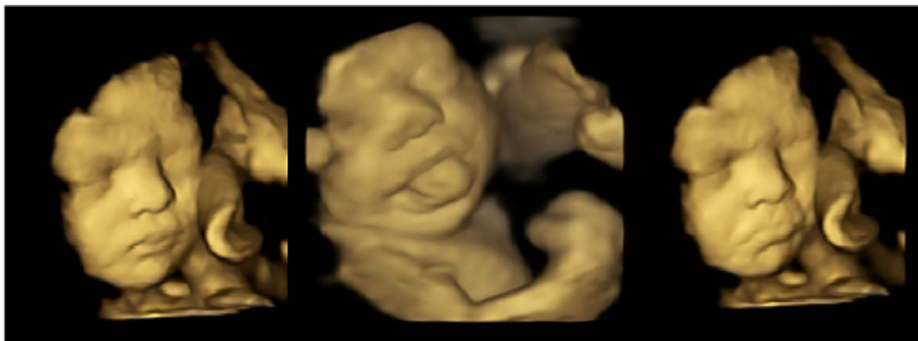
FIGURE 1 Examples of foetal mouth movements including a neutral mouth, tongue show and lower lip depressor