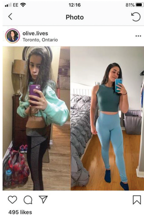
Figure 3. @olive.lives's transformation photo.

gendered bodies and their capabilities (Camacho-Miñano, MacIsaac, and Rich 2019; Rich and Miah 2014). In particular, since the advent of social media, female-dominated health and fitness spaces online have been subject to sustained academic interest. Much of this literature critiques the ways in which female members of these communities are encouraged to take up personal responsibility for disciplining their bodies in service of a specific physical ideal (Riley and Evans 2018). This kind of discourse is characterised as 'healthism', defined here as a 'colonising narrative that emphasises individual responsibility for health and wellbeing' (Fox, Ward, and O'Rourke 2005, 947). In this regard, within these female-dominated online spaces time and resource intensive activities are framed as leisure practices that are integral to living a healthy and responsible lifestyle (Jong and Drummond 2016).