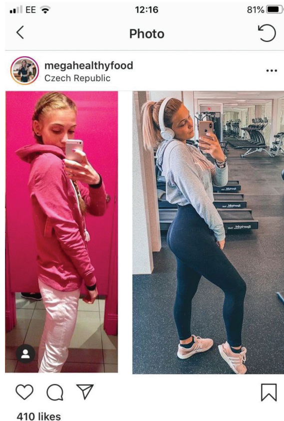
Figure 1. @megahealthyfood 's transformation photo.

and Chamberlain 2012), the psychology of social support on social media (Vogel, Rose, and Crane 2018), and of particular interest to this study, in the context of eating disorder recovery communities on Instagram (LaMarre and Rice 2017). These images are also commonly observable within online networks with a focus on sport, exercise and health, and therefore offer interesting insights with regards to how individuals come to understand their bodies and health practices through the lens of digitally mediated images. However, to our knowledge, there are no studies that explore the meanings associated with transformation photos from the perspective of the individuals who post them and as digital artefacts that have proliferated concurrently with the advent of social media. Moreover, transformation photos are integral to the process and practice of recovery for women who use weightlifting as a tool for recovery from eating disorders and therefore warrant further investigation in this context.