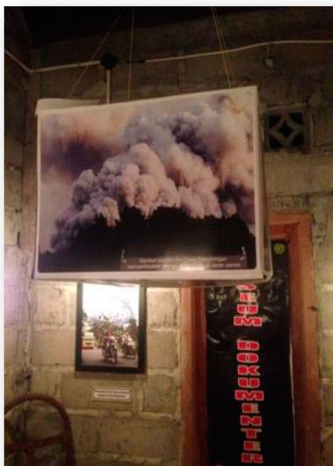
Picture 1. Photograph of a pyroclastic flow from Merapi, at a local museum (March 2016).