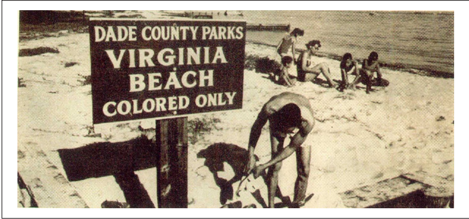
Figure 1. Beach-going at Virginia Key Beach (formerly Virginia Beach).

playground” for White tourists resulted in the relocation of Black residents to Miami’s interior, precluding them from living, playing, or relaxing “anywhere near” Greater Miami’s coastline (Connolly, 2014, p. 5, 49; see Figure 1). In 1986, Warren et al. observed “Blacks continue to confront the worst living conditions in the Miami area. Blacks possess the lowest median family income, the largest percentage of families in poverty, the worst housing conditions, and the highest unemployment rate by far” (p. 629)—a situation that has failed to improve by any significance.