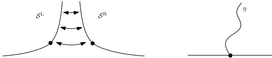
Fig. 1. Illustration of the conformal welding problem. We get a topological half-plane by welding together the two surfaces S^L and S^R . By Corollary 1.4, if S^L and S^R are independent (2, 2) -quantum wedges and the welding is defined in terms of 2-LQG boundary length, then the resulting surface (a (2, 1) -quantum wedge) has an a.s. uniquely defined conformal structure, and the interface \eta has the law of an SLE_4 .

We remark that independence of the 2-LQG surfaces S^L and S^R in Theorem 1.2 does not mean that the fields h|_{D^L} and h|_{D^R} are independent; these two fields are dependent e.g. since they induce the same quantum length measure along \eta . Instead, we have independence of the two surfaces viewed as equivalence classes. This means that if we embed the two surfaces in some standard form then the fields in this embedding are independent. Explicitly, if (\mathbb{H}, \tilde{h}^L, 0, \infty) is an embedding of S^L such that (say) the unit half-circle has unit mass, and (\mathbb{H}, \tilde{h}^R, 0, \infty) is defined similarly for S^R , then the fields \tilde{h}^L and \tilde{h}^R are independent.