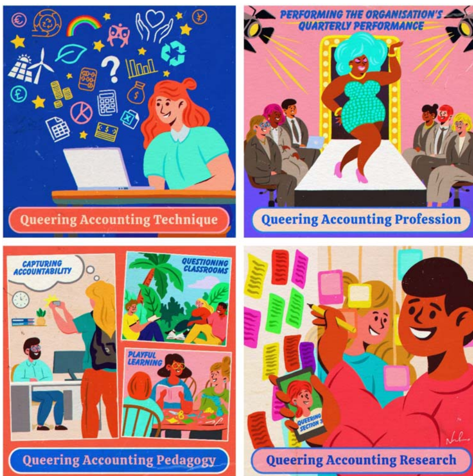
Figure 1. Queering accounting sites.

doing so, we see the limitations in numbers and advocate for new and creative ways of representing diverse realities. In queering the accounting profession, we encourage accounting professionals to be open to diverse perspectives, new ways of engaging and humanistic ways of being professional. Calling for an opening up and connectedness across the profession that fosters greater diversity and a more holistic, integrated mindset. In queering accounting pedagogy, we shine a light on the hidden curriculum to provide opportunities for challenging heteronormative discourse. We advocate for the queering of pedagogical techniques to envisage new ways of learning and to reimagine the nature of accounting classrooms. In doing so, we call for the opening of space in accounting education for all voices to be heard. Through queering accounting research, we urge researchers to engage with queer voices and identities in accounting. We further call for the queering of research practice, opening up accounting research to queer methodologies and non-normative research frameworks and forms of dissemination. Figure 1 provides a visual representation of the multiple accounting sites we call to queer.