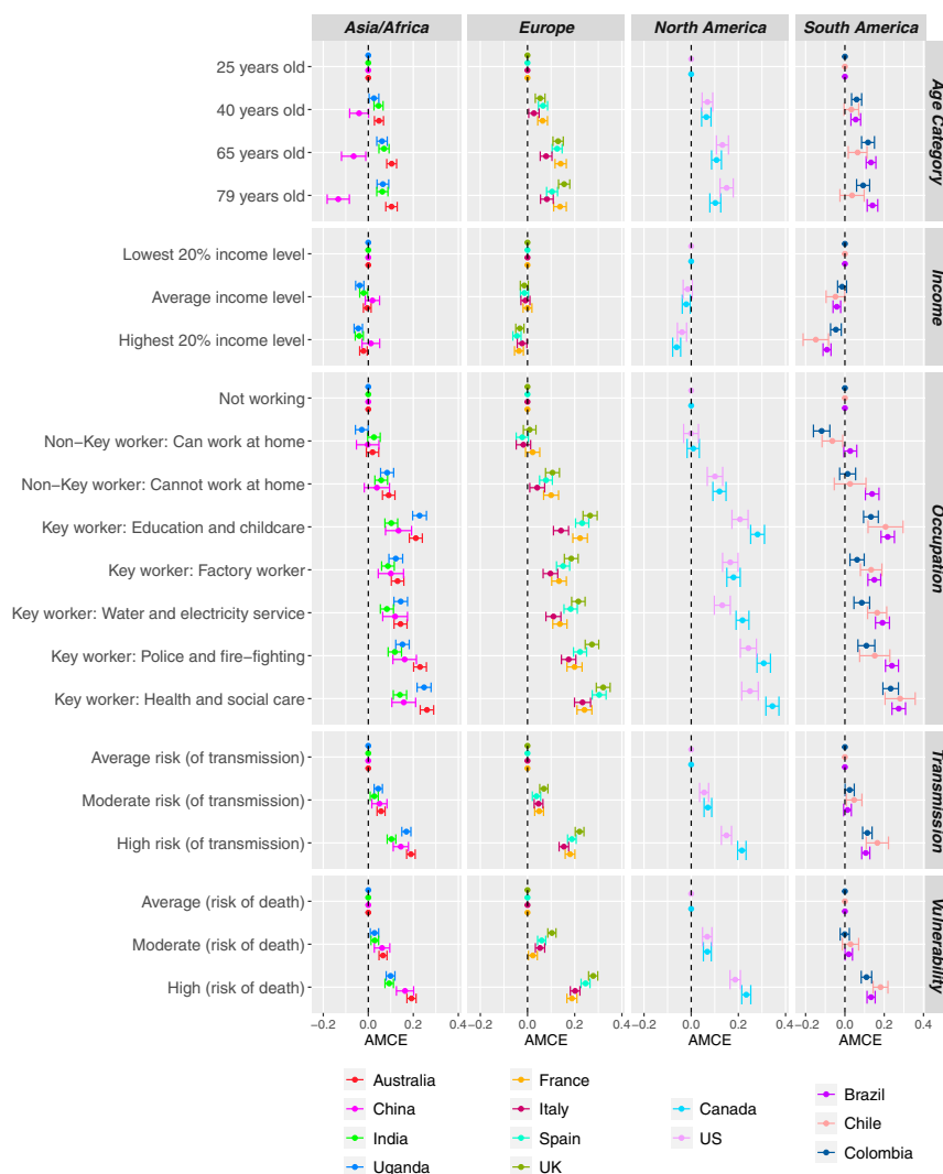
Fig. 2. Vaccine candidate decisions by country. AMCEs are reported for each attribute value. The 95% CIs are shown for each point estimate, clustered by subject. Models are weighted to reflect the respective national populations, excluding India and Uganda, which represent primarily urban samples.

correlations are suggestive; the public in weak-capacity states seem to be more enthusiastic about private provision than is the case in the higher-capacity states in our sample.