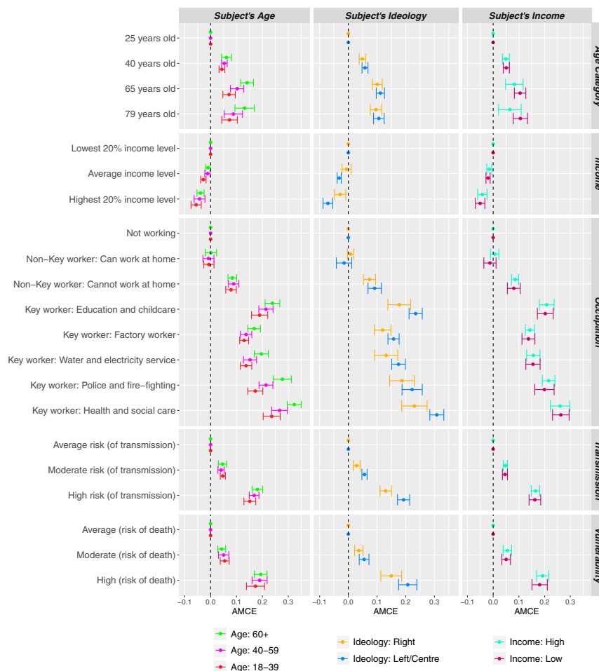
Fig. 3. Vaccine candidate decisions by age, income, and left–right self-identification. AMCE estimates are reported for attribute values (observations are pooled across countries). The 95% CIs are shown for each point estimate, clustered by country. Observation weights are not used.

(Table 1), public preferences for prioritization appear to be largely consistent across countries and larger regions. Moreover, when we estimated the conjoint model for subgroups in the samples, we found that preferences were consistent across a range of respondent characteristics, such as age and income (Fig. 3).