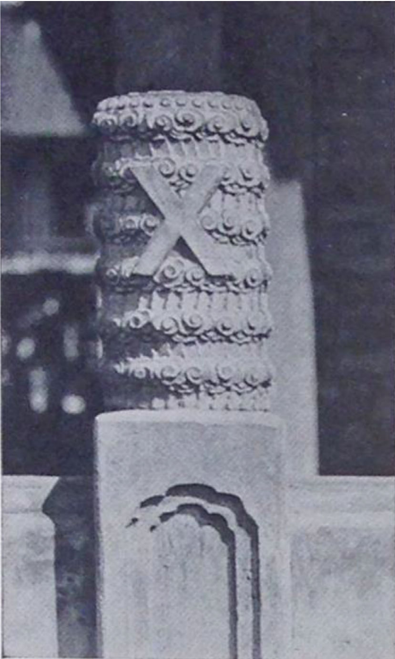
Figure 7. The American Architect , 5 June 1929.