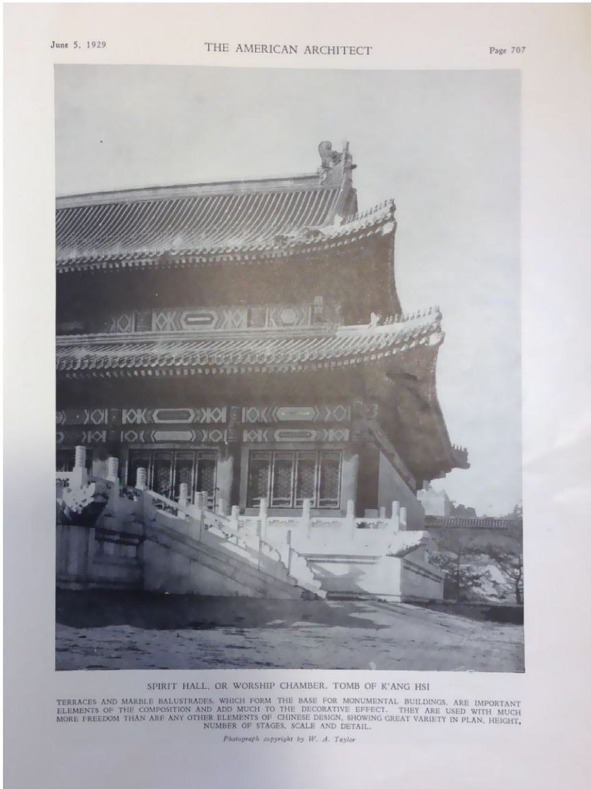
Figure 3. The American Architect , 5 June 1929.

Note: The caption says: 'Spirit Hall, or Worship Chamber, Tomb of K'ang Hsi. Terraces and marble balustrades, which form the base for monumental buildings, are important elements of the composition and add much to the decorative effect. They are used with much more freedom than are any other elements of Chinese design, showing great variety in plan, height, number of stages, scale and detail.'