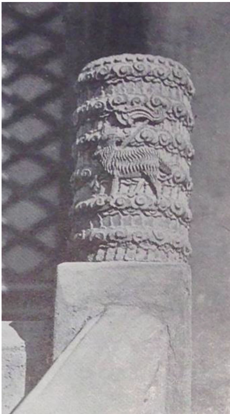
Figure 8. The American Architect , 5 June 1929.