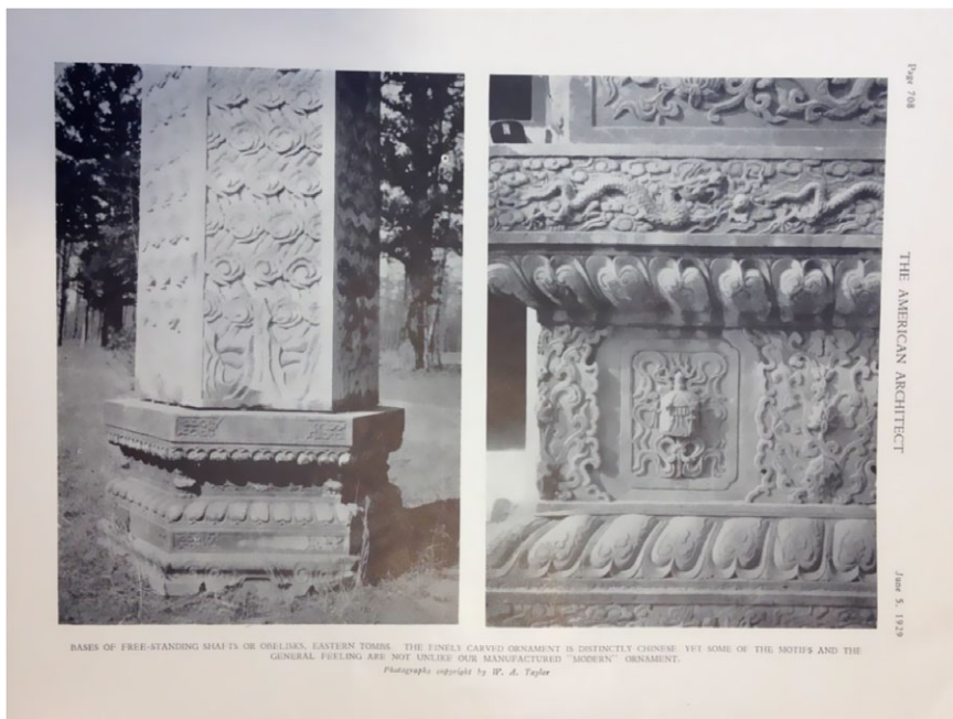
Figure 4. The American Architect , 5 June 1929.

Note: The caption says: ‘Bases of free-standing shafts or obelisks, Eastern tombs. The finely carved ornament is distinctly Chinese. Yet, some of the motifs and the general feeling are not unlike our manufactured “modern” ornament’.