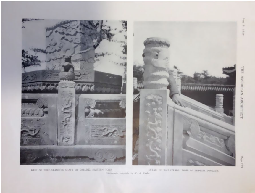
Figure 5. The American Architect , 5 June 1929.

Note: Caption says: (left) 'Base of free-standing shaft or obelisk, Eastern tomb'. (Right) 'Detail of balustrade. Tomb of Empress Dowager.' [Empress Dowager Cixi (1861-1908)]