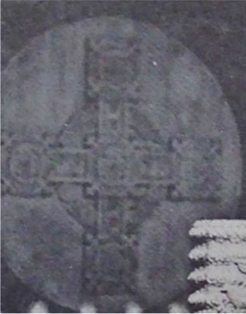
Figure 9. The American Architect , 5 June 1929.