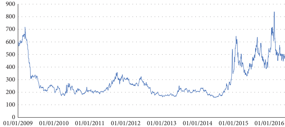
FIGURE 1: Mean daily CDS spreads for the sample countries.