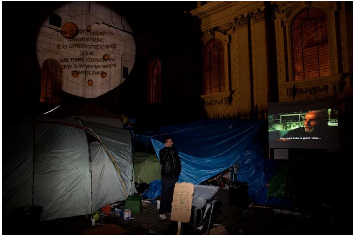
Figure 6. Spectacle Messaging at Night