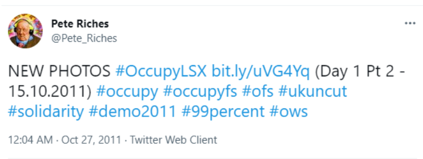
Figure 5. #OccupyLSX Sharing Photos

Hashtags also served another important symbolic purpose. Occupiers tried to solve the problem of unequal access to power associated with password control of movement social media accounts by using hashtags and the retweet facility of the Twitter account to tweet and be seen on Twitter. As Andy noted: