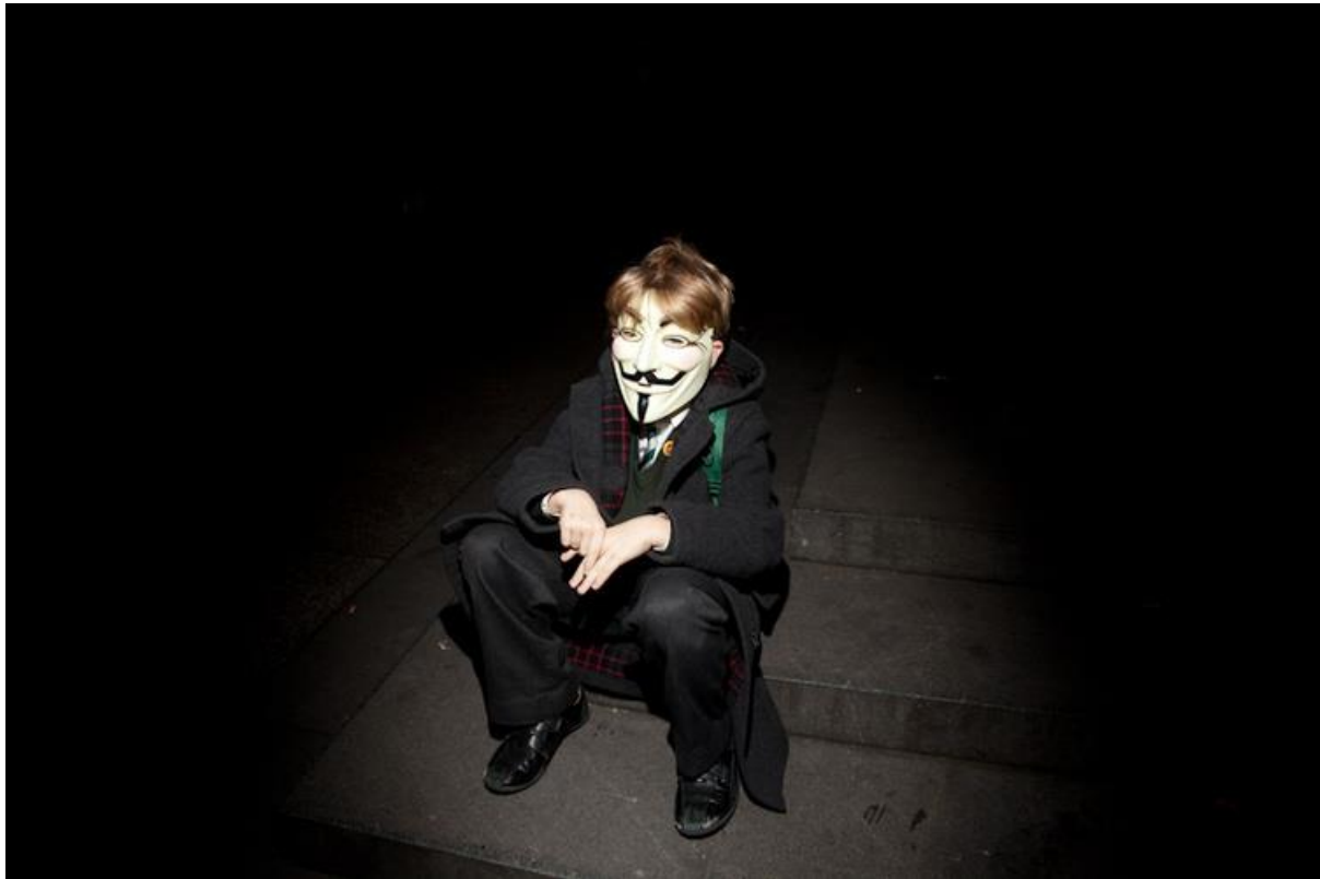
Figure 3. Protestor wearing a Guy Fawkes mask

Contemporary photographs, online communications, and TV news reports show the prominent place of the Guy Fawkes mask in the iconography of the protest (see Figure 3). Popularized by the movie ‘V is for Vendetta’ and adopted by other protest groups such as Anonymous (hence, the alternative name ‘Anonymous Mask’), the masks were seen as symbols that obscured identities of any potential leader of the group. The Guy Fawkes mask was thus a symbol of leaderlessness and the desire for equality.