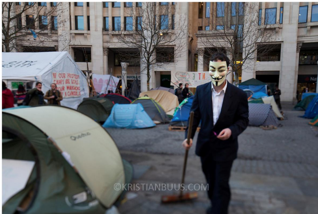
Figure 8. Visually Capturing Space, Symbol, and Spectacle

We suggest that ‘leaderless’ movements need to be understood not just as collections of protesters who reject formalized authority structures, but also as systems that generate particular forms of meaning. Our exploration of OL revealed that leadership in the movement was effectively replaced by repertoires of protest that were manifested multimodally. The image of a mask wearer at the St Paul’s encampment in a photograph taken by Kristian Buus epitomizes the modes of space, symbol, and spectacle (see Figure 8) and thus opens our discussion.