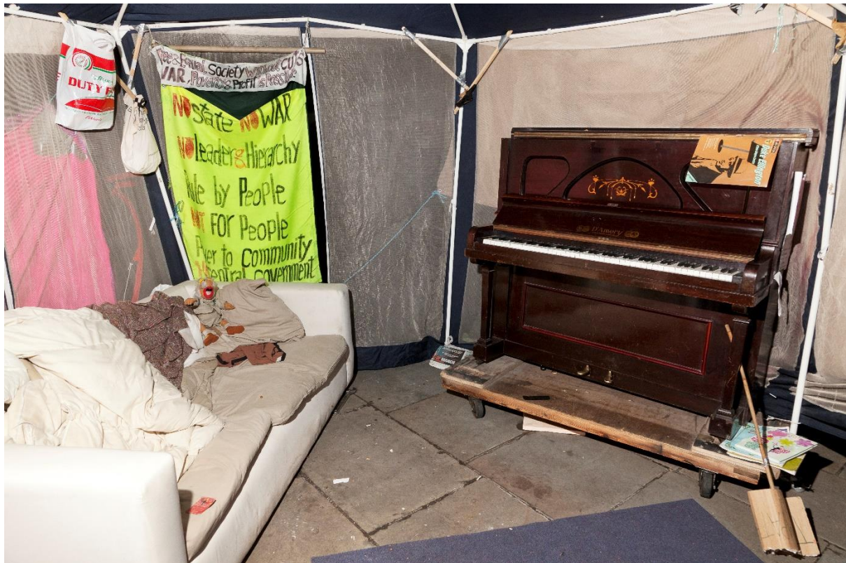
Figure 1. No Leader – Encampment Tent