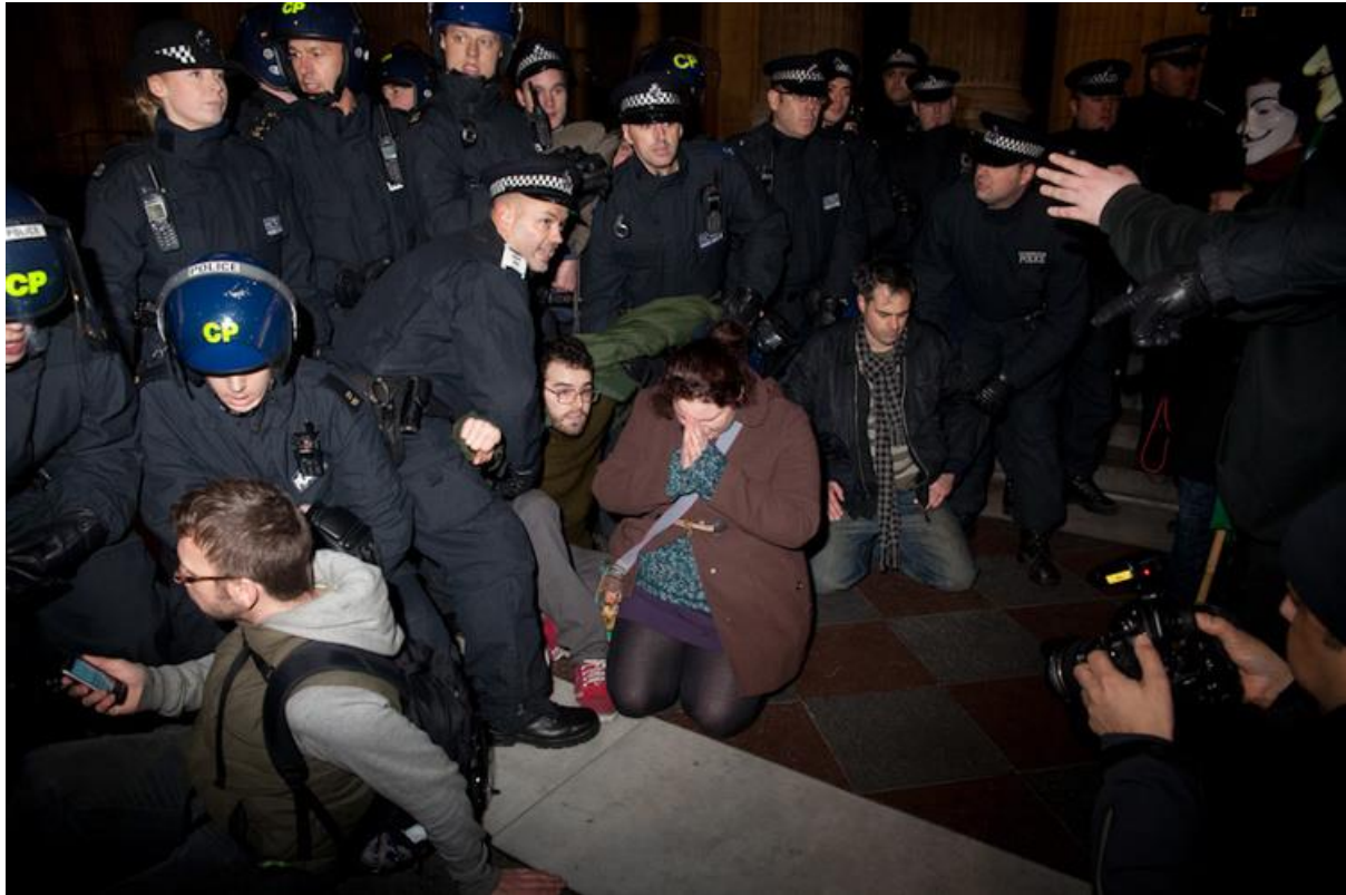
Figure 7. Kneeling protestors removed from St Paul's