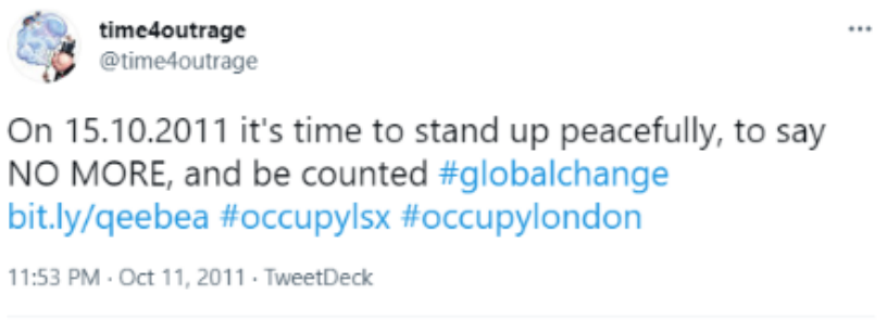
Figure 4. #OccupyLSX Call to Action