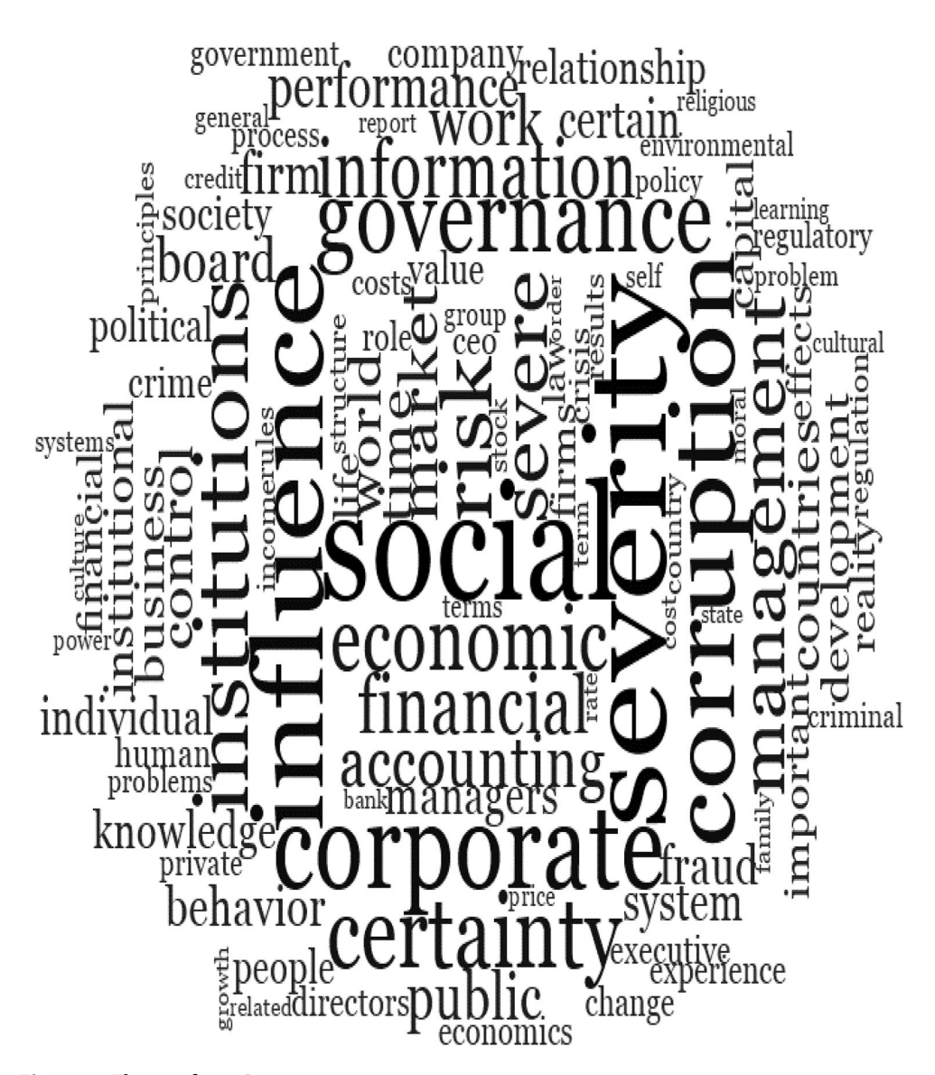
Figure 1. Themes from Data.

we investigated the link among the subcategories to articulate higher-order categories. At this stage, we observed that some subcategories, e.g. corruption and regulation, are relevant to more than a single higher-order category, e.g. certainty of punishment. Consequently, such subcategories were added to the respective higher-order categories. In the final stage of data analysis, we adopted a selective coding approach to explore the relationship between the higher-order categories. The selective coding process helped create the main category, which identifies the core influences in the choice decisions of executives in Nigeria.