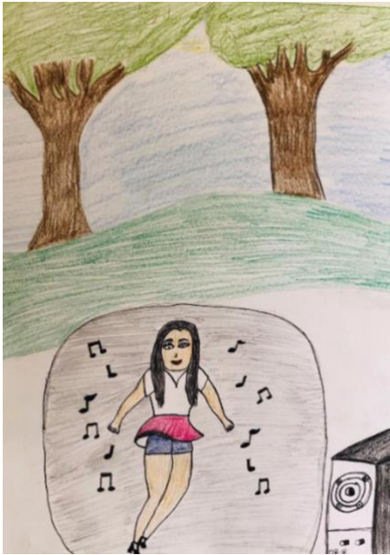
Figure 2. Channelling discomfoting emotions artistically to foster hope.

those emotions, fostered hope and allowed the personal transformation ('comfort and peace') using drawing, dancing and music. [page 11 ends here]