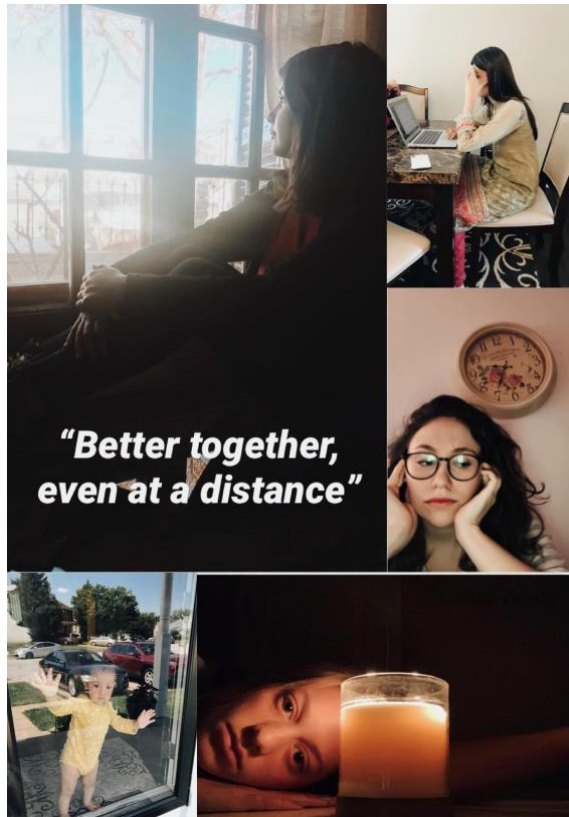
Figure 4. Picture collage by a mixed international group.