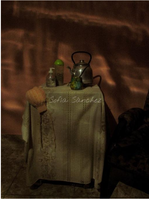
Figure 3. Coping with discomfoting emotions using photography.

Source. The student is an amateur photographer and added her name to the photo as a watermark, asking that her real name be included in any publication.