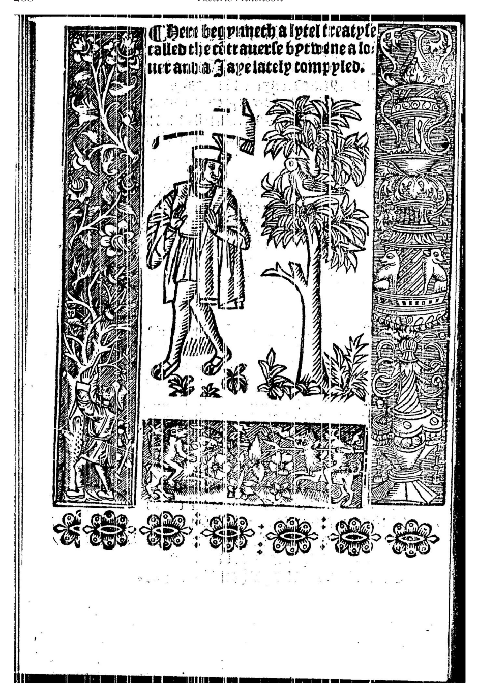
Fig. 3 Thomas Feylde, The contrauerse bytwene a louer and a jaye (London: De Worde, [1529?]) STC 10838.7, titlepage. British Library, C.132.i.45