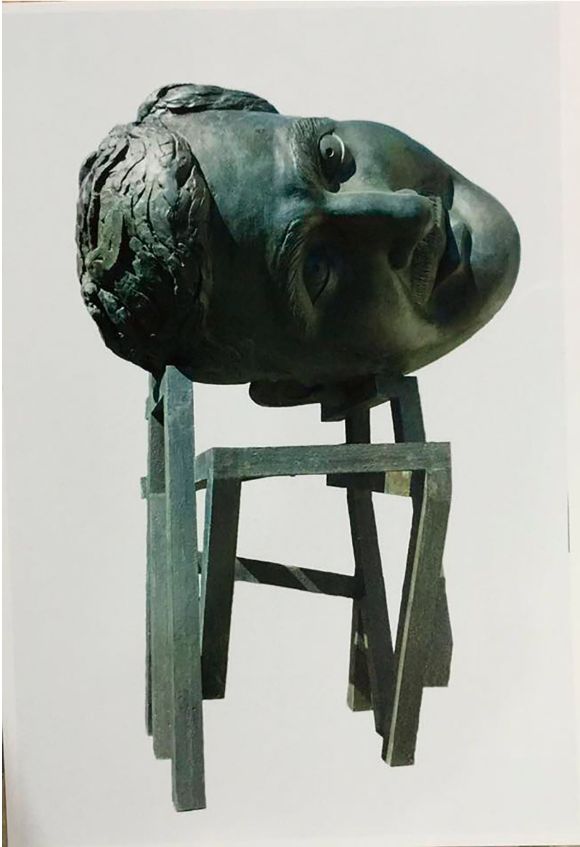
Figure 3. Ahmadi Dalak Statue in Sulaymaniyah, 2016, Bronze and Stone, 500 × 130 × 120 cm. Copyright Baldin Ahmad. Courtesy of Baldin Ahmad.

Hamalaw's account, Dalak's torture was extensive and brutal: his eye was removed, he was left to bleed for days on end, and was even placed on the torture chair as a gruesome display for the other prisoners. Finally, Dalak was transferred to the acid room on his torture-bloodied chair in the hope