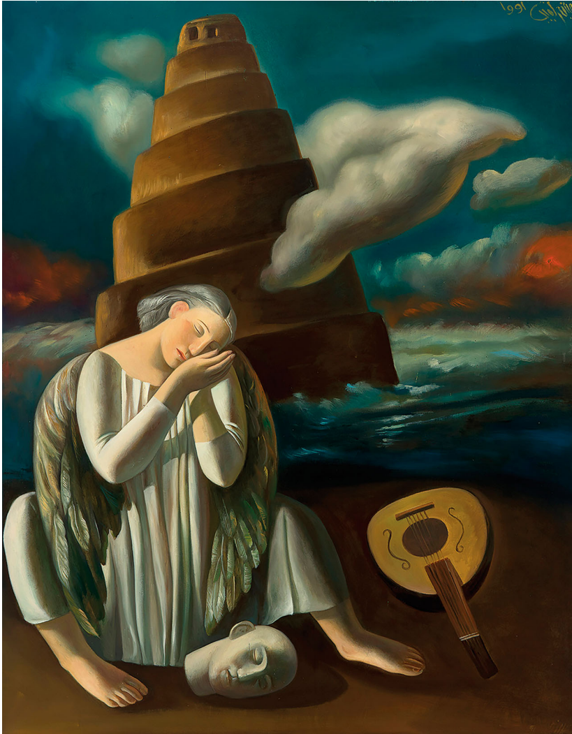
Figure 2. The Flood , 1991, oil on canvas, 70 × 90 cm. Copyright Afifa Aleiby. Courtesy of Afifa Aleiby website.

front of the minaret, and surrounded by large clouds and violent waves, an angel sits on the shore with her legs wide apart. Between the angel's feet rests a severed head. The angel is depicted weeping while the serene-looking head rests on one side and in the direction of the viewer. For Aleiby, the angel embodies purity and nobility even as she weeps over the tragedy of her people while the presence of the severed head becomes the extreme expression of these tragedies. As the artist notes in an interview, the painting 'reflects my pain, in the image of this agonised angel crying on the civilisation