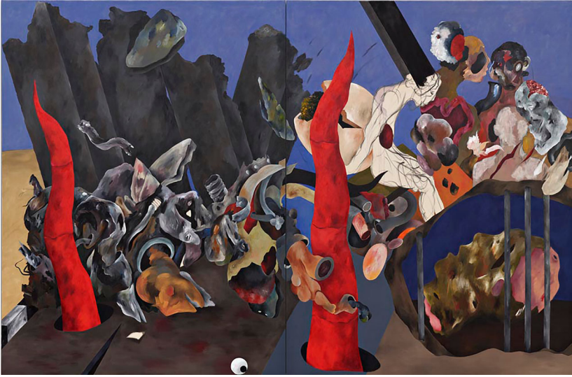
Figure 4. Baghdad II , 2008, Acrylic on canvas, 250 × 380 cm. Copyright Ahmed Alsuodani.

scene depicted is reminiscent of a standard day in the life of Baghdad citizens: a car has crashed into an American security zone, red flames are seen rising from the ground in a stylised and dramatic manner and an eyeball sits in the centre of the painting. In this complex composition, a female figure is also drawn into the scene rather than painted on it like the rest of the visual elements.