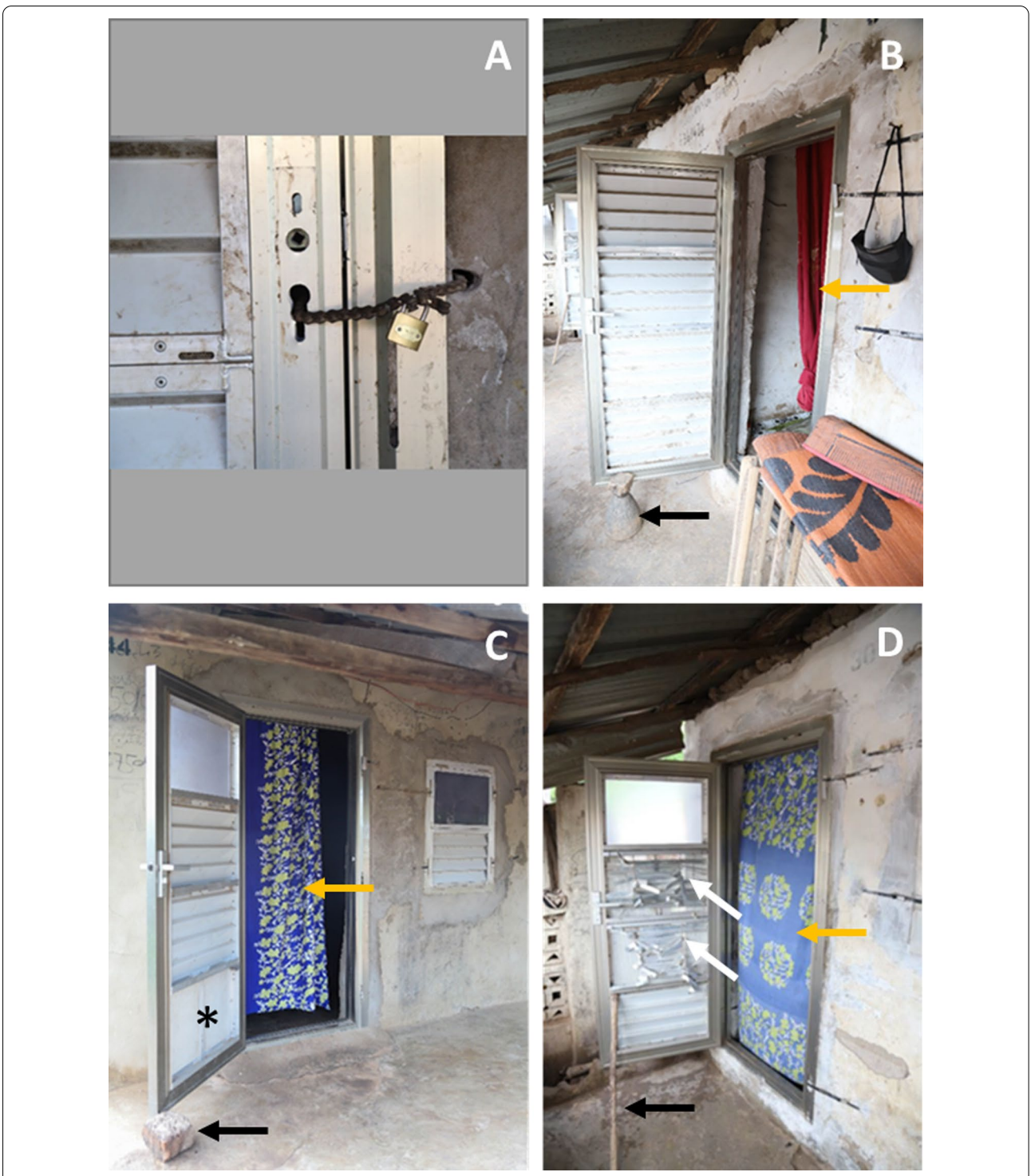
Fig. 3 Examples of door usage showing modifications and damage to blinds. A The door handle has been lost and the home owners have made a hole in the wall to use a bicycle chain and padlock to secure the door; B door propped open to prevent automatic shutting (black arrow); C loss of blinds in the lower panel (asterix) and the door kept ajar during the day with a brick (black arrow); D damaged blinds in the two middle door panels (white arrows) with the door get open with a stick (black arrow). Note brightly coloured curtains (orange arrows B–D)