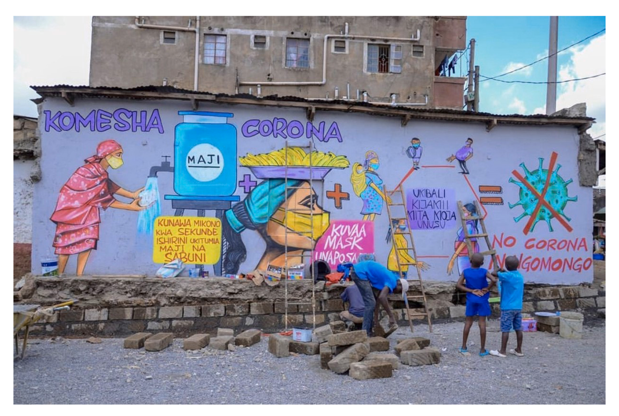
Fig. 4. Daddo Omutitii 'Place-making, public engagement community awareness through #TalkingWallProject advocacy in intervention during Covid19' (Dandora, Nairobi), source: Black Clarity Pictures https://www.instagram.com/p/B-0NUyjg5c1/(accessed 06/12/20).

C. McEwan et al. Political Geography 98 (2022) 102692