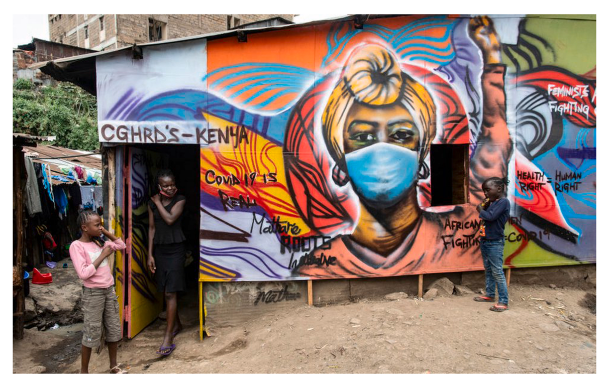
Fig. 1. Mathare Roots Initiative, 'Feminists Fighting Against COVID-19' (Mathare, Nairobi), source: https://www.instagram.com/p/CBylZfypNou/(accessed 16/7/2021).

wearing when Covid-19 was first in Tanzania, which was well-received (ibid.).