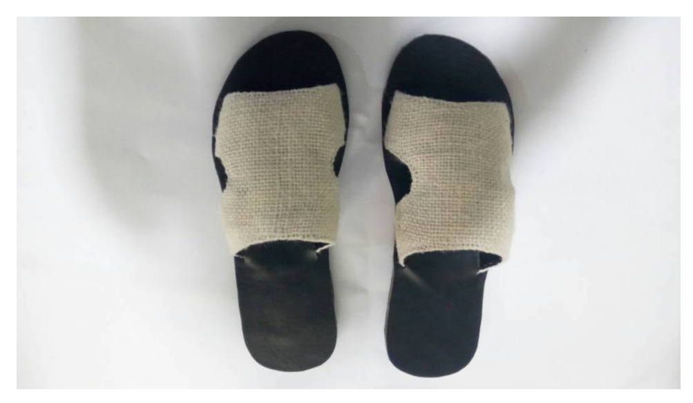
Fig 2. A pair of transfluthrin-treated sandals. https://doi.org/10.1371/journal.pone.0271833.g002

Observations were done for six hours starting either early morning (for day-biting Ae. aegypti ; 06:00am to 12:00 noon) or early evening (for night-biting An. arabiensis ; 06:00pm to 12:00 mid-night). During each experimental replicate, 100 sugar-starved female mosquitoes