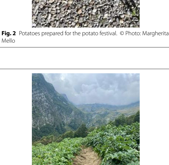
Fig. 3 Potato field in the Otro Valley.

different local potato varieties were widespread in the area, at the beginning of the twenty-first century, local producers were cultivating international varieties. Local varieties were lost due to the depopulation of the valley, which intensified after WWII, and above all to the abandonment of local varieties and the practice of keeping their seeds, due to the availability of cheap high-yield