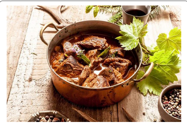
Fig. 4 Uberlekke stew.

In 2021, two of the local commercial potato producers decided to distribute one potato to each of the participants in order for them to plant it and return the