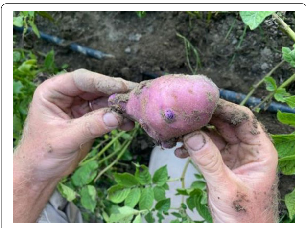
Fig. 6 Morella potato.