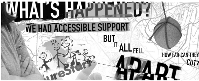
FIGURE 1 A system hollowed out

I think some of the ones that were situated before were in some of the areas that needed it ... and I think there were others that maybe they didn't need it in those areas ... But, yes, there are still areas within [the city], I would say, that maybe still need something within the heart of that community, yes, even if it's a satellite type unit. (Family Hub Practitioner-1)