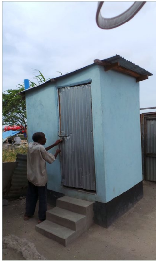
FIGURE 2 Improved toilet in Mji Mpya after the implementation of the Simplified Sewerage System