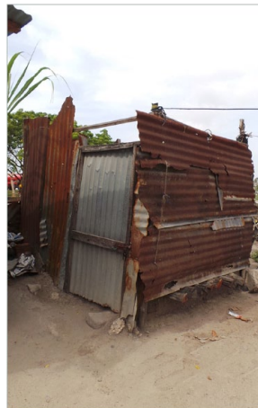
FIGURE 1 A pit latrine in Mji Mpya before the implementation of the Simplified Sewerage System

Most of the surveyed residents and those in focus groups remarked on the improved condition of the toilets, and especially the reduced smell within the house, the greater ease of cleaning and the enhanced privacy and “ dignity ”, particularly for women. A key improvement, consistently identified, was the easier accessibility of the new toilets for children, elderly people and people with disabilities. As one female upstream resident said: