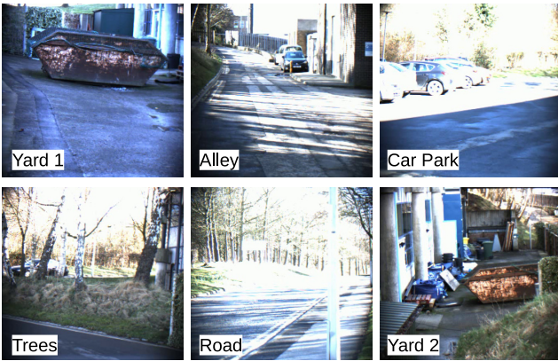
Figure 5. Six reference scenarios used for evaluation.

in Figure 4 where we can see a visualisation of the resulting HST (Hue, Saturation, Thermal), TCrCb (Thermal, Chroma-red, Chroma-blue), and rgT ( \{r, g\} chromaticity, Thermal) colour models in comparison to stand alone RGB and infrared (thermal, T).