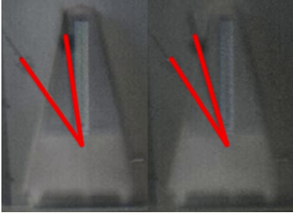
Figure 3. Overlain visible and infrared band for unsynchronised (left) and synchronised (right) image frames.

The remaining issue of temporal synchronisation between the frame buffers of the two diverse cameras within the sensing arrangement (Section 2.1), is tackled using a simple 555 timer circuit to externally trigger the cameras at 50Hz and hence provide a synchronised frame rate of 25fps (frames per second). Our cross-spectral hardware synchronisation is evaluated through the observation of a mechanical metronome (Figure 3), for which the simple harmonic motion the motion of the metronome is described by:-