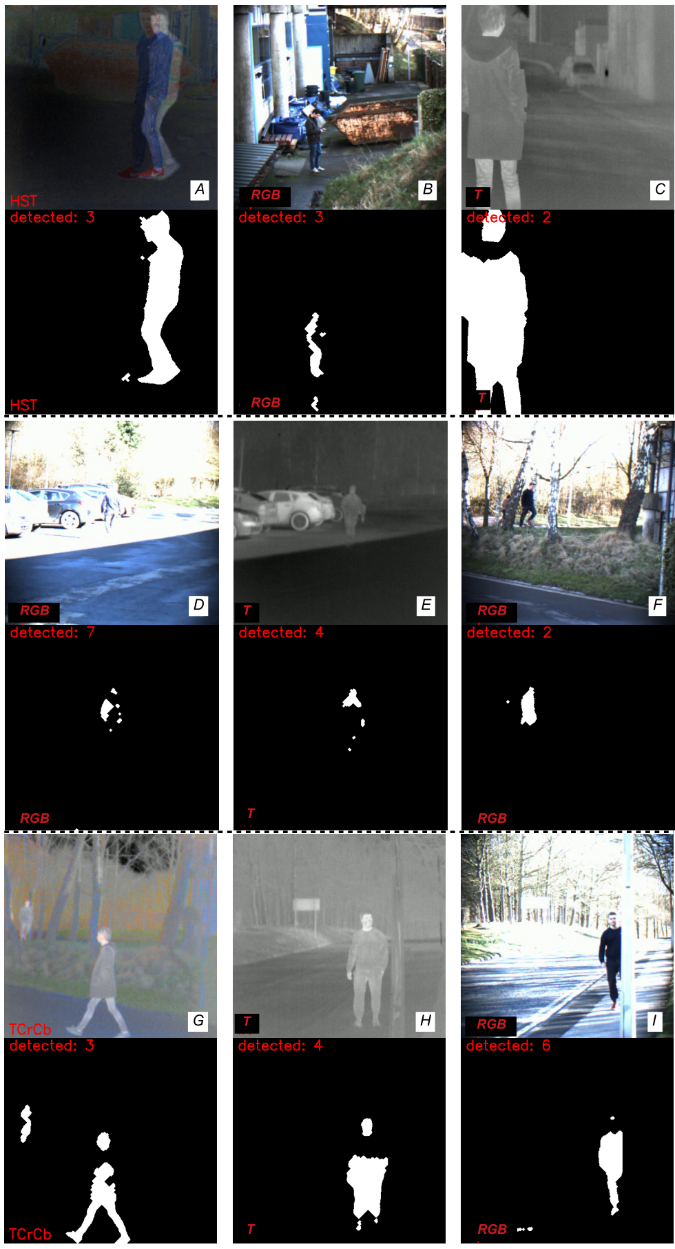
Figure 7. Exemplar foreground object detection - failure cases (A - I).