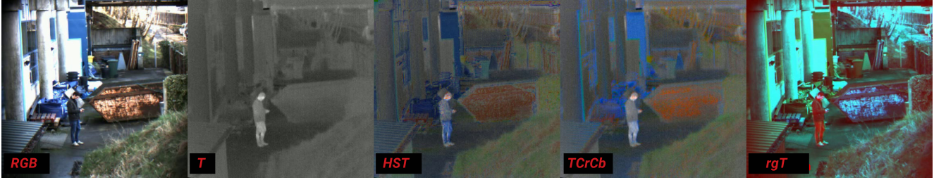
Figure 4. Exemplar RGB, infrared and varying visible-infrared fusion models (left to right).

in Figure 4 where we can see a visualisation of the resulting HST (Hue, Saturation, Thermal), TCrCb (Thermal, Chroma-red, Chroma-blue), and rgT ( \{r, g\} chromaticity, Thermal) colour models in comparison to stand alone RGB and infrared (thermal, T).