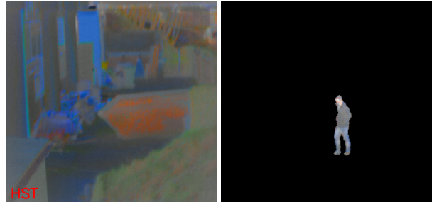
Figure 1. Exemplar - a background model (left) and extracted foreground object (right) using the HST fusion model.

More broadly, the complementary nature of using both colour and (far, long-wave) infrared has seen them ex-